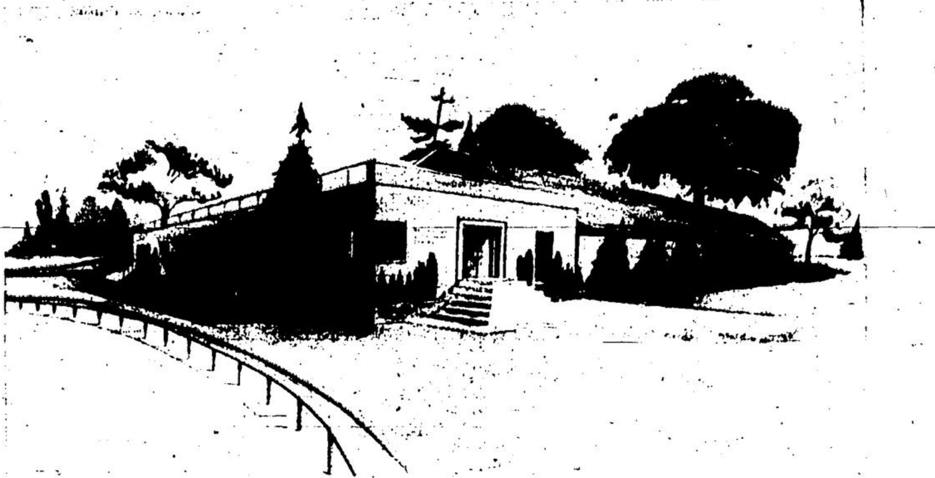
Artist's conception of the proposed Community Centre Building.

As a true community centre the new building will provide the best recreational and community activities possible for each and every dollar spent.