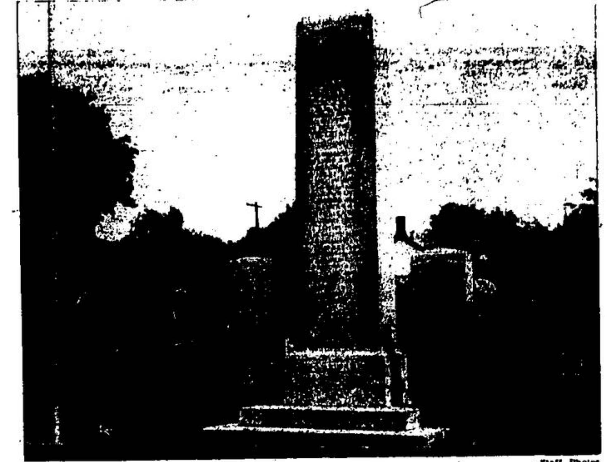
IN SOLEMN REVERENCE the Guelph Sea Cadets Honor Guard stand at the Cenotaph in Acton during the annual Decoration Day Service and Parade. Crowds lined Mill Street from the C.N.R. tracks to Main Street to witness the parade consisting of four bands and local and district organizations as well as town officials.