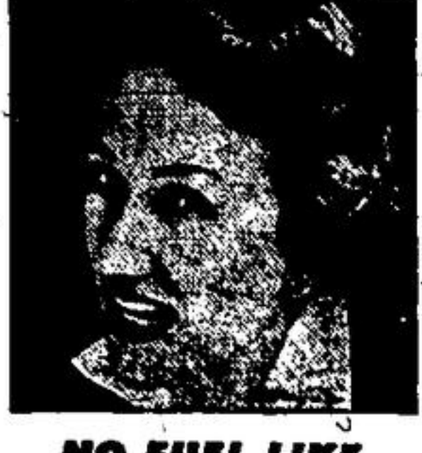
NO FUEL LIKE THIS FUEL!