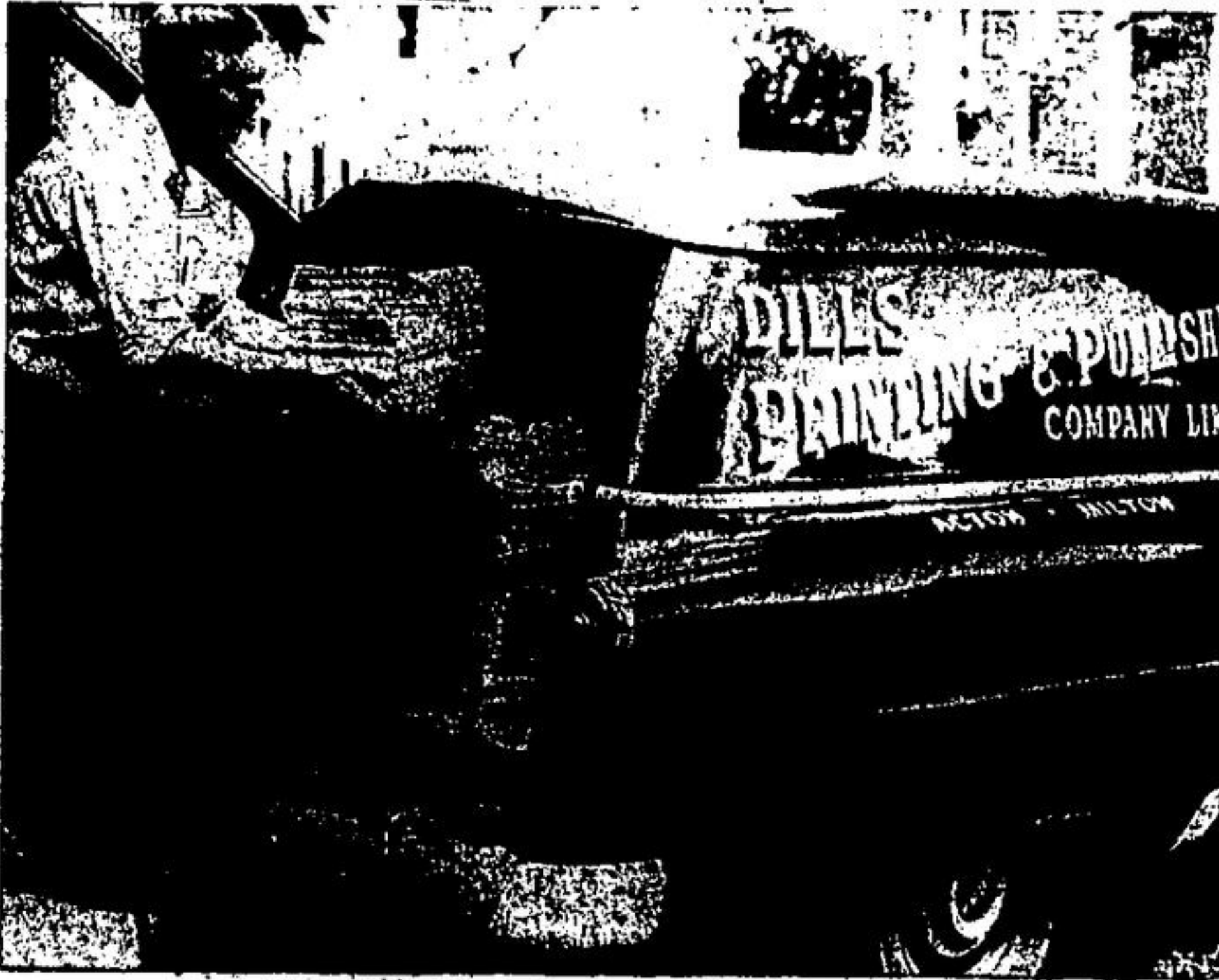
SCENES LIKE THE ONES pictured on this page happen every Thursday when your weekly newspaper The Acton Free Press comes off the press. Shown in this first photo is Lawrence Wick loading the truck with marked bundles for delivery to local store agents around town where non-subscribers buy their weekly newspaper The Acton Free Press.