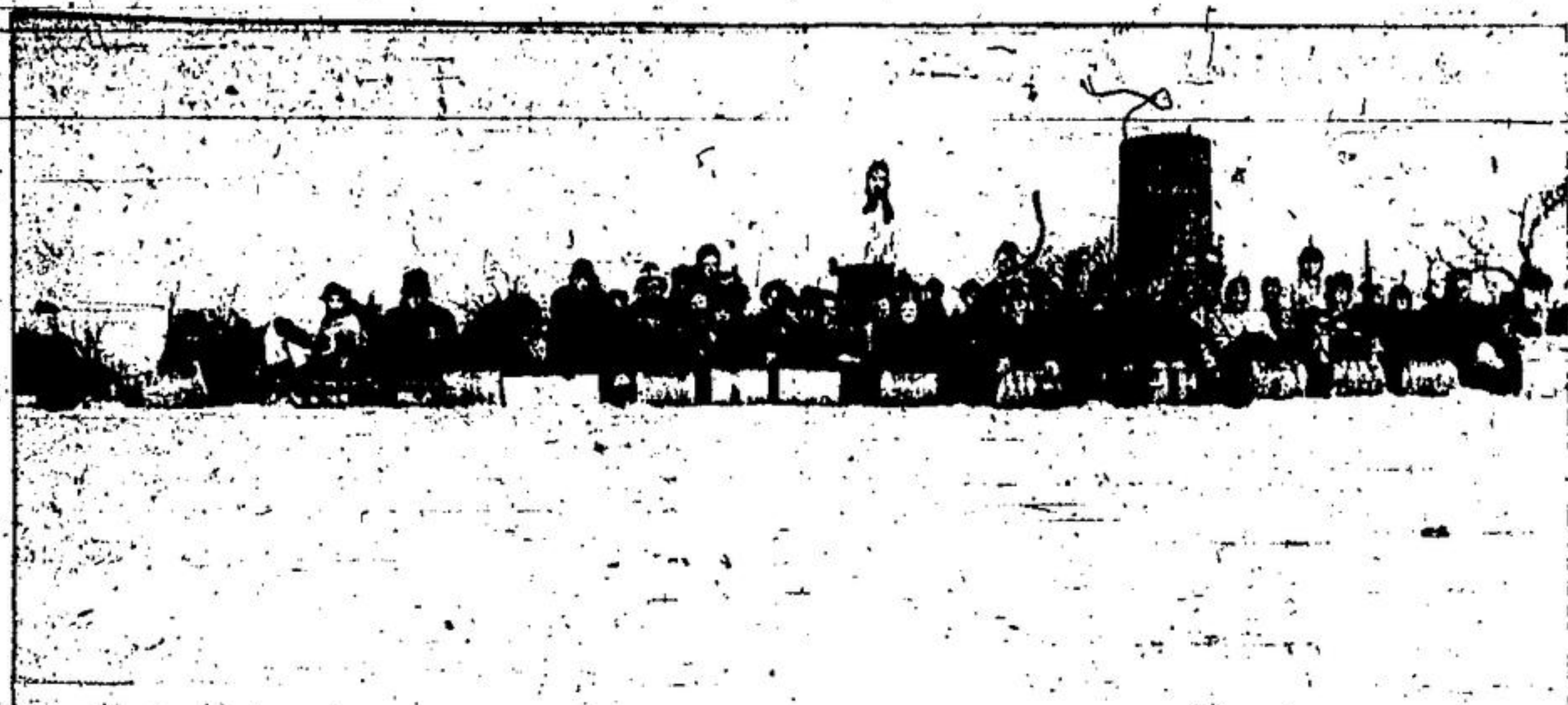
READY TO ROLL Eden Mills children are pictured on their toboggans during the annual outing last Saturday when the Community Club sponsored the event. Kiddies were present with toboggans, sleighs, flying saucers and even enjoyed