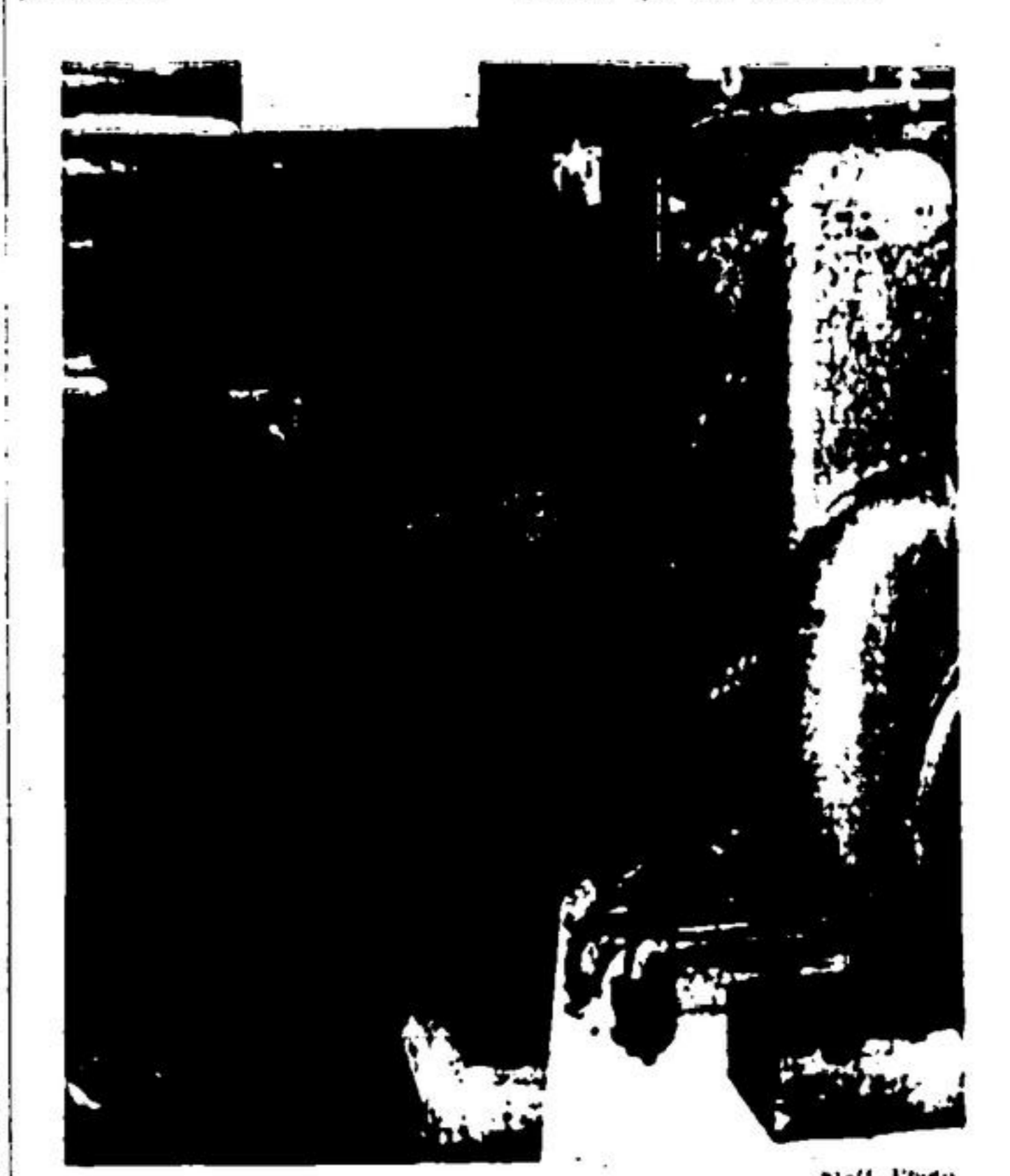
WATER PRESSURE at the Main Street pumping station is checked by Water superintendent J. Lambert. This well was turned into the town system in 1952 and at present is pumping 90 gallons of water per minute into the system. Some of the superintendent's chores constitute a daily check on this well and the number one spring well east of number 25 highway.

Reasons Cited Some of the reasons cited in the referendum were: (1) the expense of the P.U.C. staff; (2) the fact that the P.U.C. staff could handle all the work both electrical and otherwise; (3) the fact that the P.U.C. staff could be paid out of the same office; (4) the fact that the P.U.C. staff could be paid out of the same office; (5) the fact that the P.U.C. staff could be paid out of the same office.