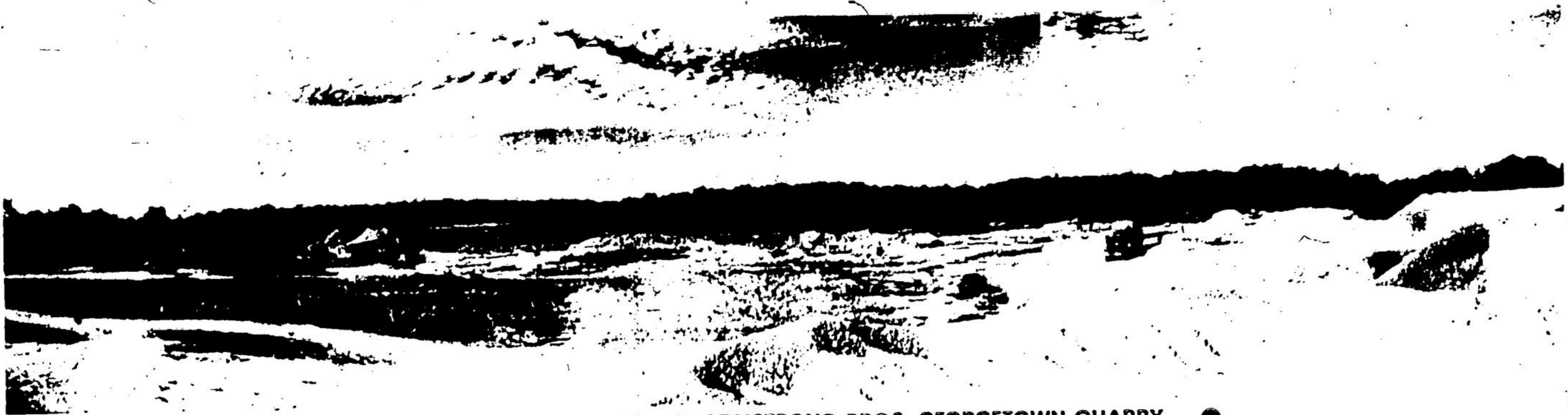
● PANORAMIC VIEW OF THE ARMSTRONG BROS. GEORGETOWN QUARRY ●