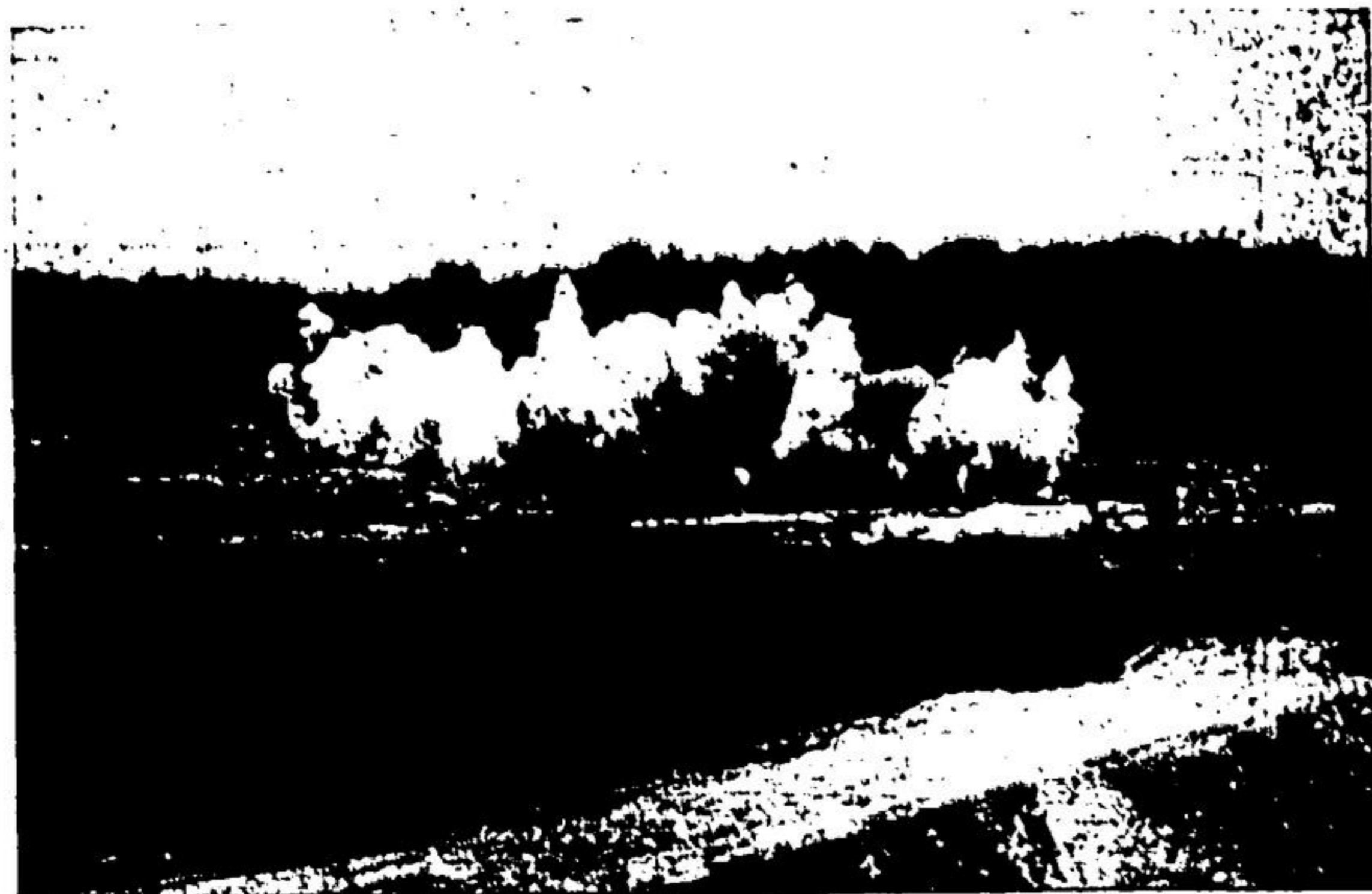
AFTER THE DRILL HOLES are loaded with dynamite the charge is detonated. Seven thousand tons of rock were blasted in this photo.