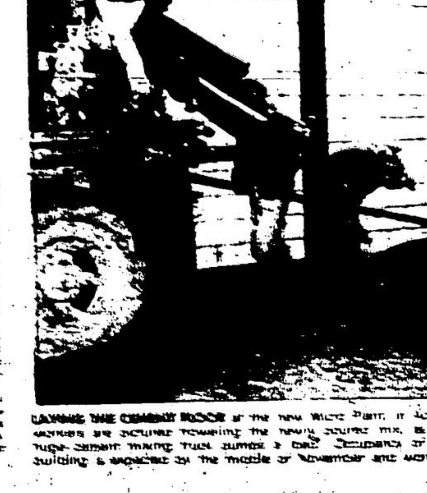
LOADING THE CONCRETE BLOCKS at the new Micro Plastics Plant in Acton. The building is almost ready for occupancy by the middle of November and workers are being fastened up and the roof is being completed.