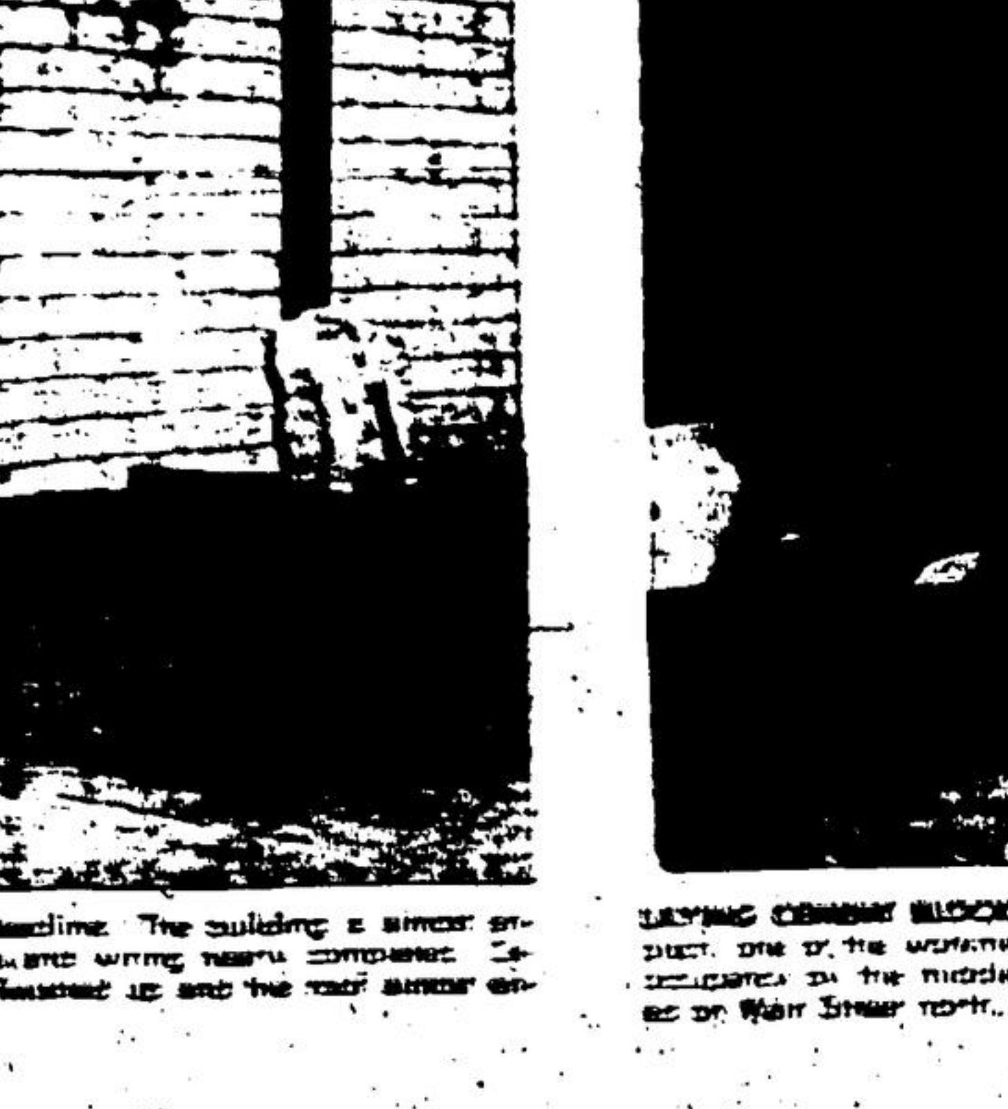
LOADING THE CONCRETE BLOCKS at the new Micro Plastics Plant in Acton. The building is almost ready for occupancy by the middle of November and workers are being fastened up and the roof is being completed.