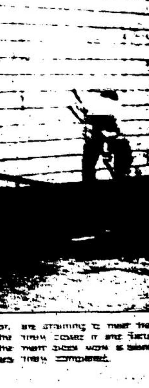
LOADING THE CONCRETE BLOCKS at the new Micro Plastics Plant in Acton. The building is almost ready for occupancy by the middle of November and workers are being fastened up and the roof is being completed.