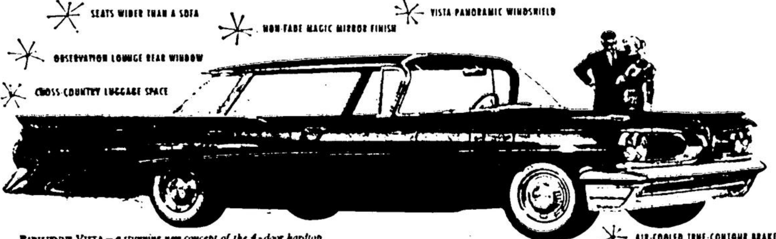
PANORAMIC VISTA—a stunning new concept of the 4-door hardtop