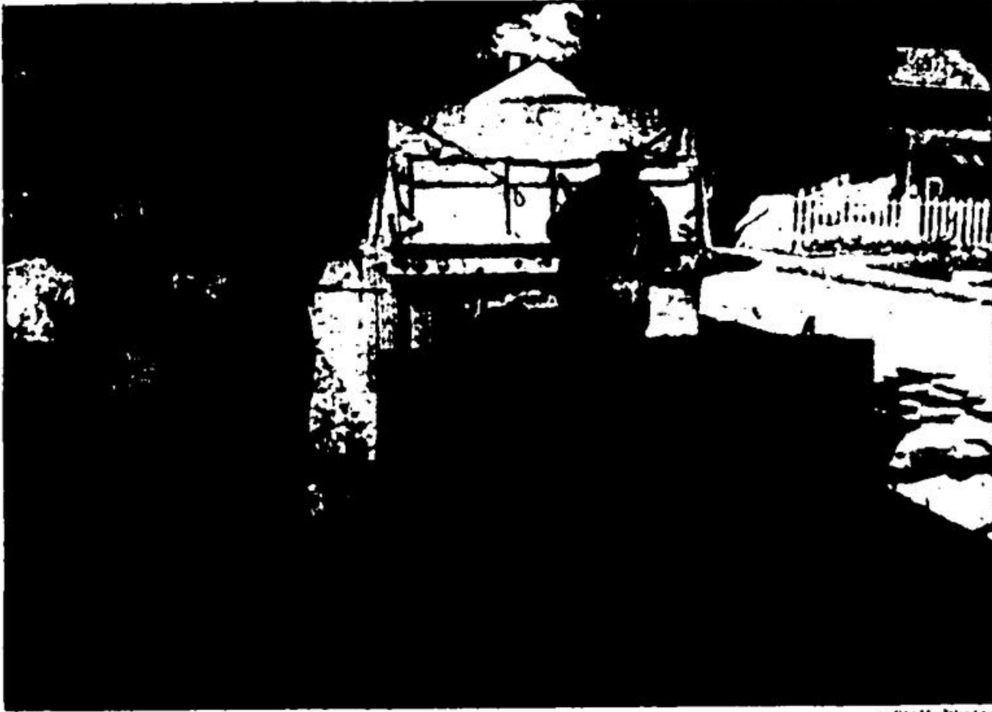
KNOX AVENUE PAVING was completed this week and shown above workmen begin to lay the secondary surface of asphalt on the stretch of roadway. Paved in 1956 when the balance of the town was done, this stretch of roadway broke up and this year was re-surfaced. A few interested children stand by as the first load of asphalt is spread. Credit Valley Paving Company were contractors for the resurfacing.