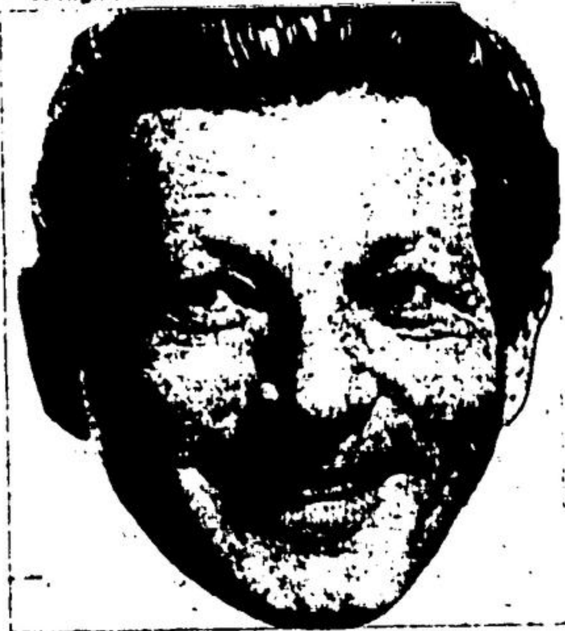
Danny Kaye, Grandstand Headliner

29 Major Prizes During the period of the Exhibition, there will be 29 other major prizes to be won by visitors to the building. Included are freezers, refrigerators, radios, television sets and washer and dryer combinations. Some lucky visitor could need the station wagon to carry home his merchandise prizes.