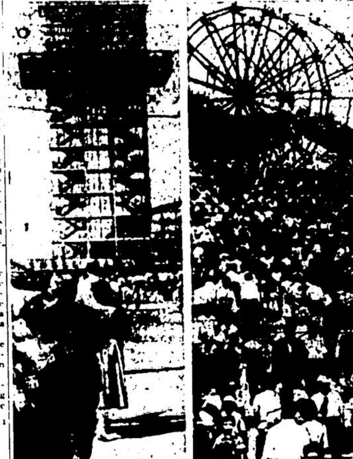
A High Point Midway Thrills for all