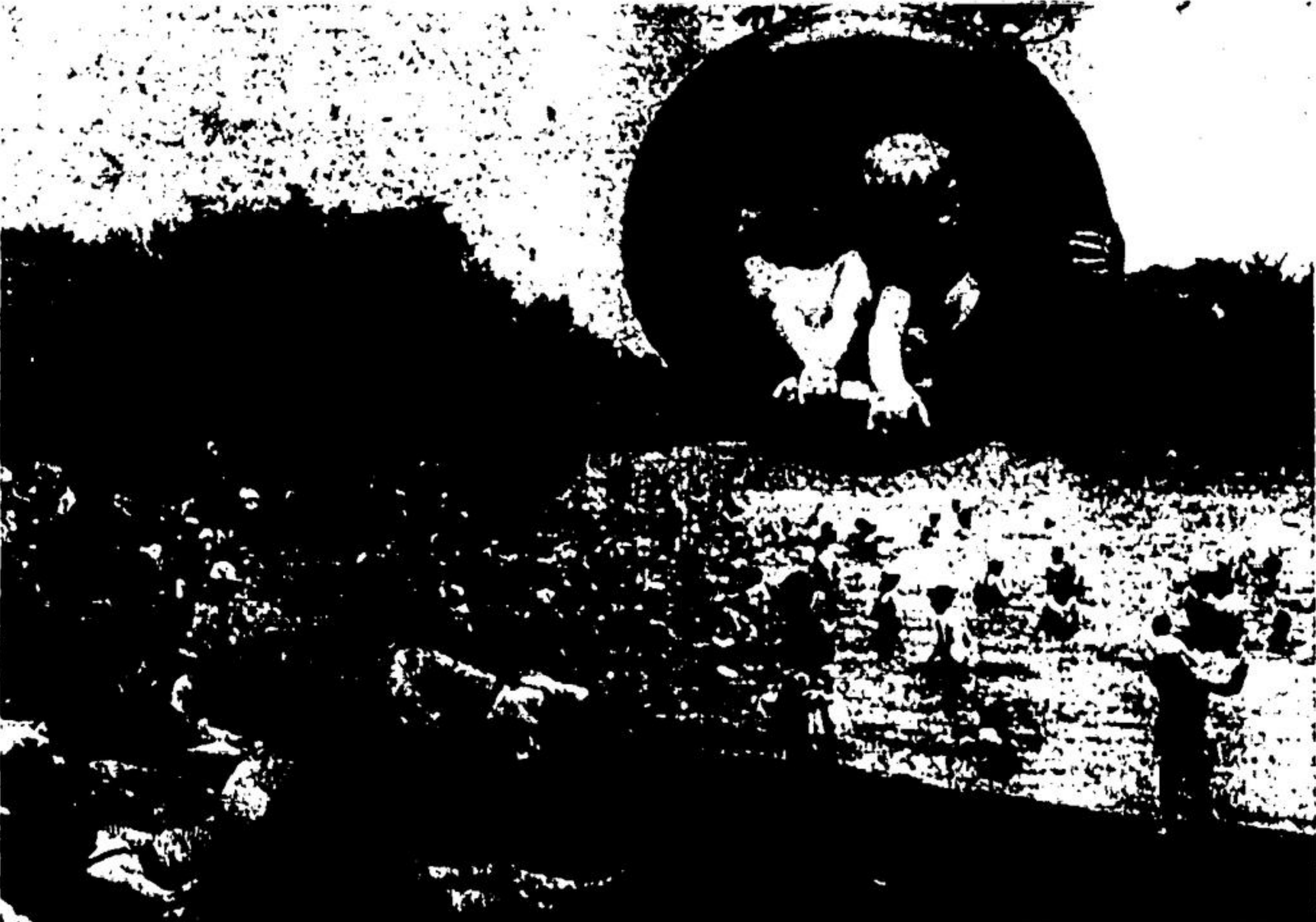
DOMINION DAY HOLIDAY turned Acton Park into a beehive of activity as adults and children, from far and wide, congregated to enjoy the swimming, fishing, boating, baseball and other facilities. Shown inset are Joey Lancaster and Peter Sorbara, of Guelph, as they take a glimpse of Acton park through the inner tube borrowed from dad's car. Lower photo shows a portion of the beach area at the park during the holiday activity as young and old attempted to beat the heat in the cool water of Fairy Lake. Reports state there were over 400 crowding the beach area.