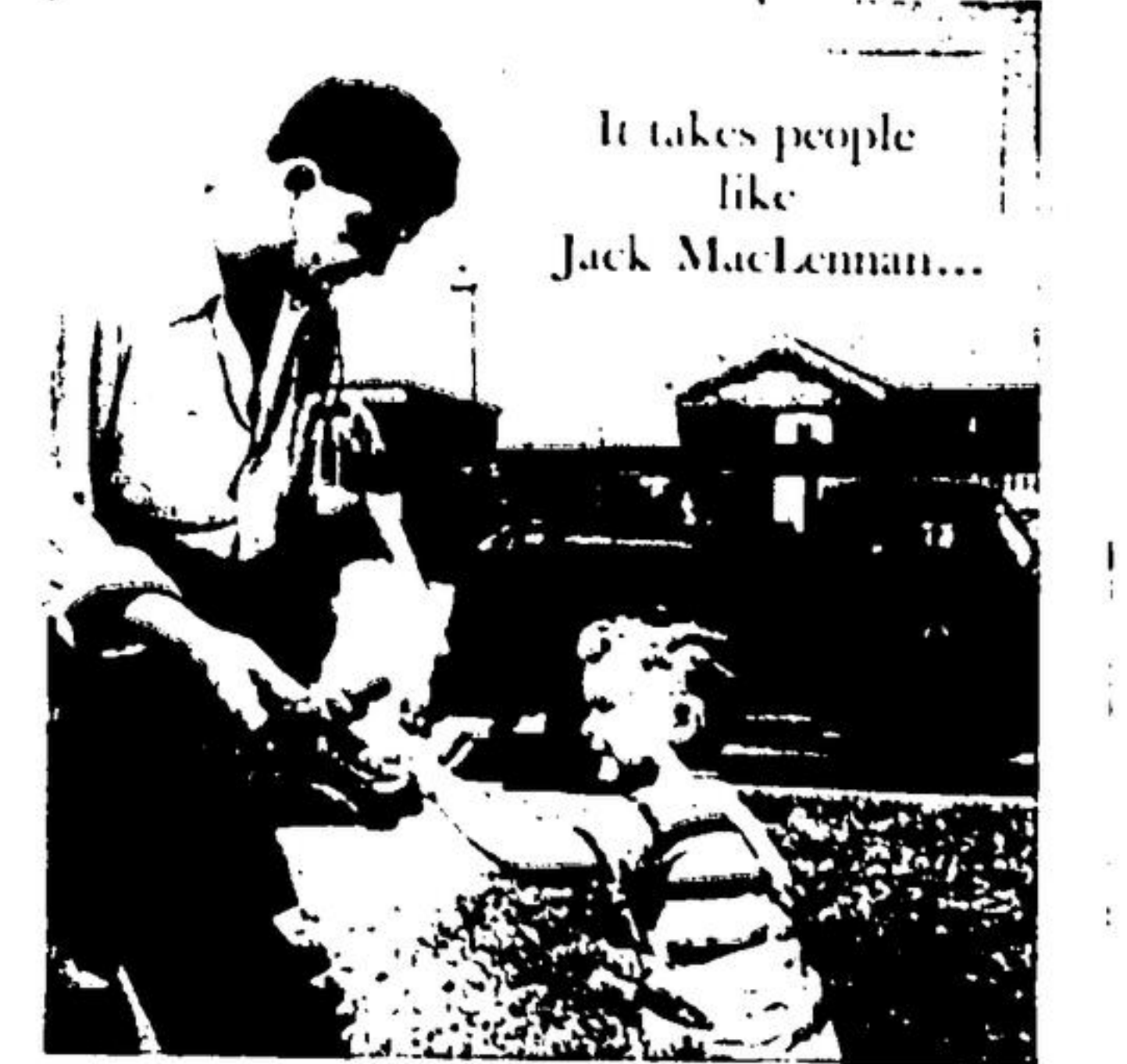
...to give you good telephone service