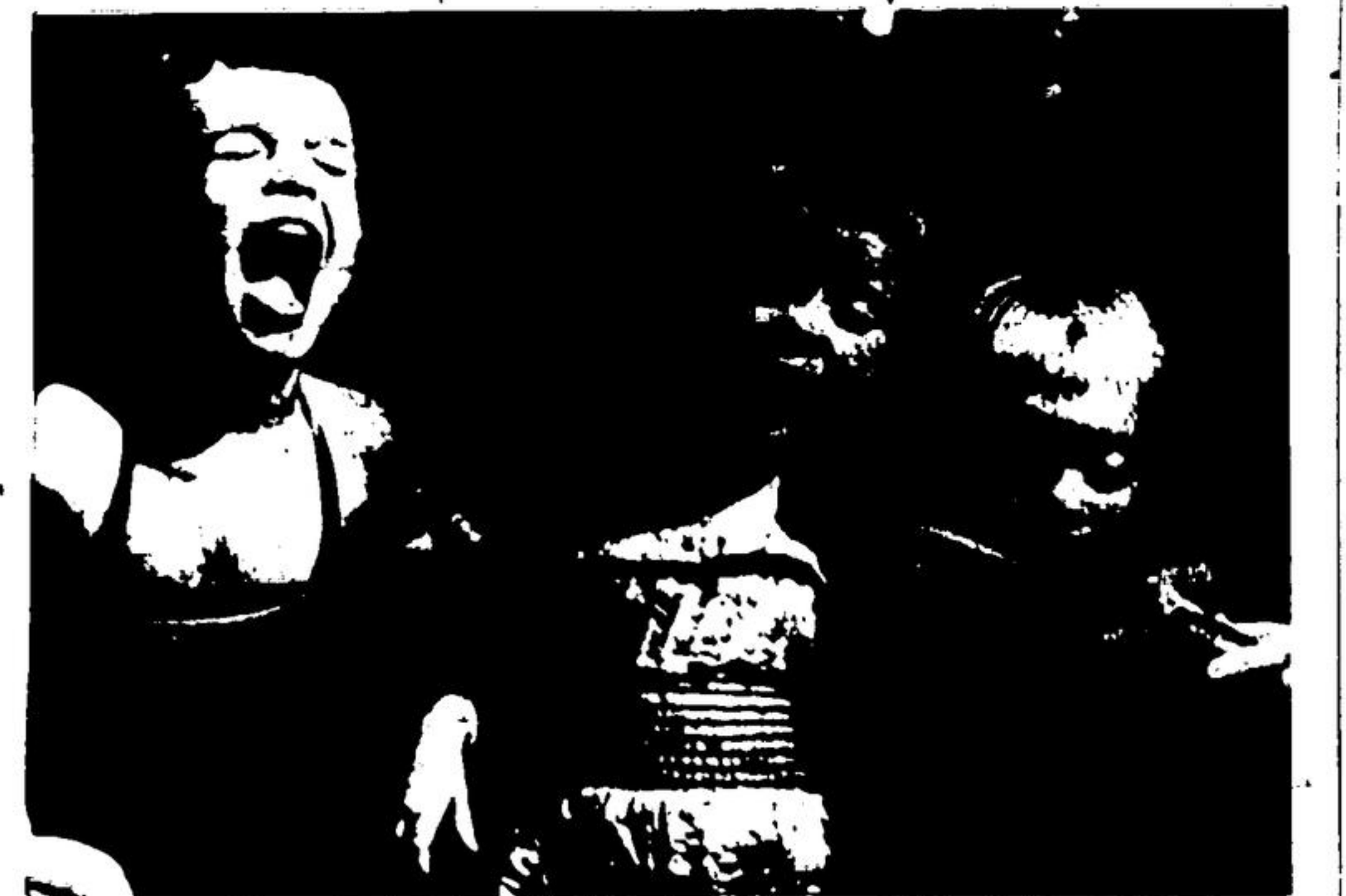
THE BEST WAY to cool a fella off on a hot summer day is by the water from the garden hose. This picture wouldn't have half the appeal if it had been taken in direct sunlight.

It is reported that the farming community here is producing a high quality of produce. The community is proud of their work.