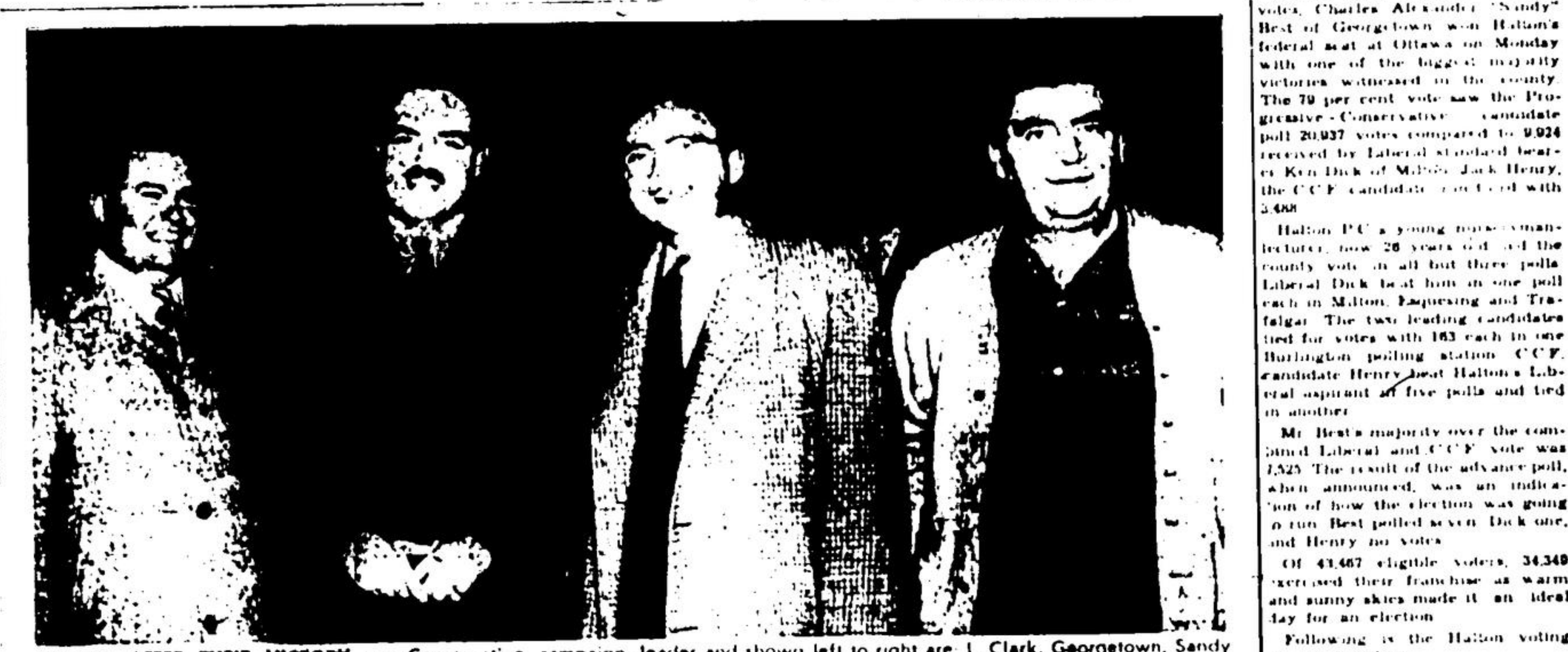
SMILING AFTER THEIR VICTORY are Conservative campaign managers with "Sandy" Best M.P., who was elected in Acton by a majority of 307 votes on Monday night. A motored crowd of Acton supporters gathered at the committee room here to greet Mr. Best.