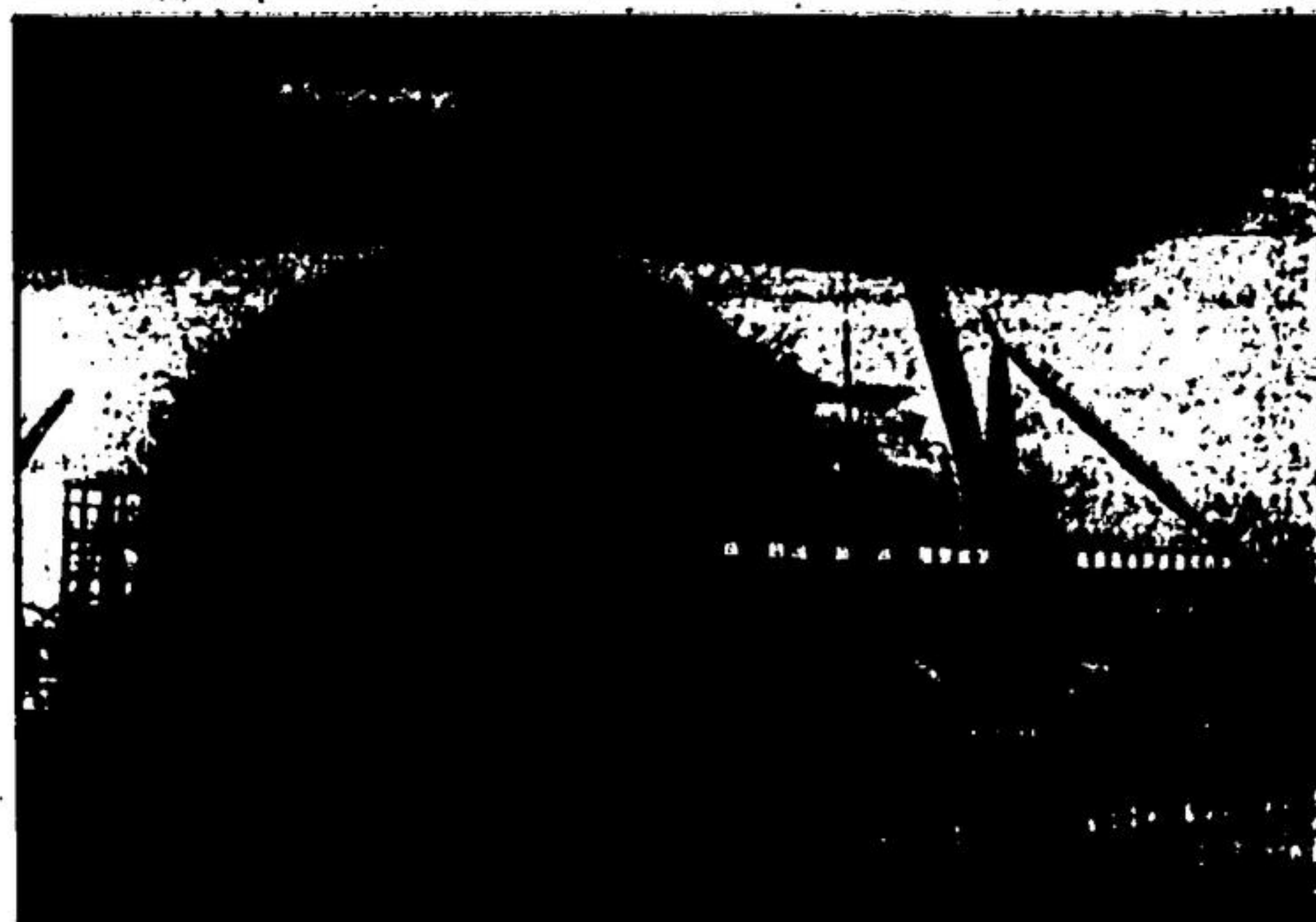
The peaceful use of atomic energy is one of the four main themes of the United Kingdom stand at the Canadian National Exhibition in Toronto. This is a general view of the fast Ekipan reactor nearing completion at Deserway in the north of Scotland.