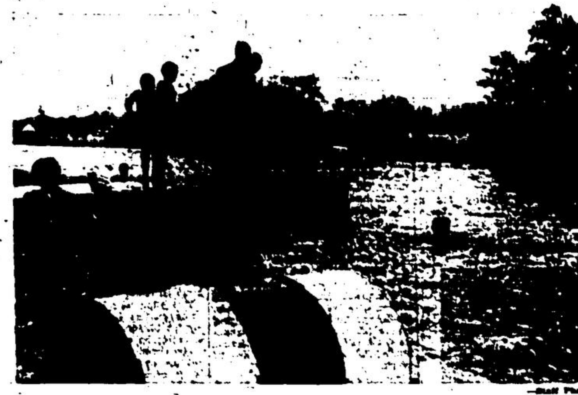
ENJOYING THE NEW diving pier at Fairy Lake, boys and girls are busy these days, courtesy of the Acton Y's Men's Club, who supplied the pier. The diving pier is one of the many projects completed or planned for the park by the service club.