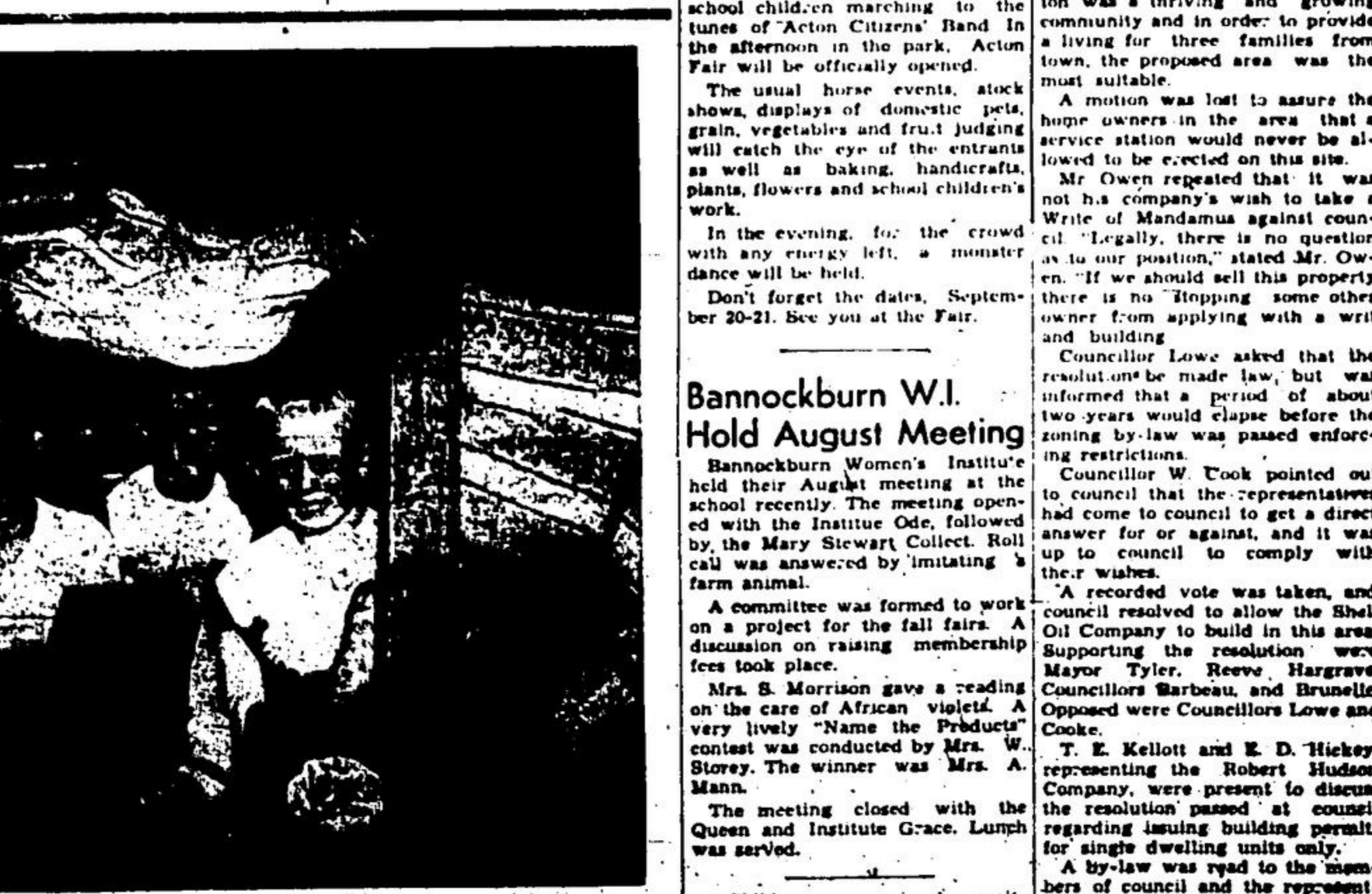
Children are anxiously awaiting their return to school. The scout addition is progressing favorably and the well points have been removed.