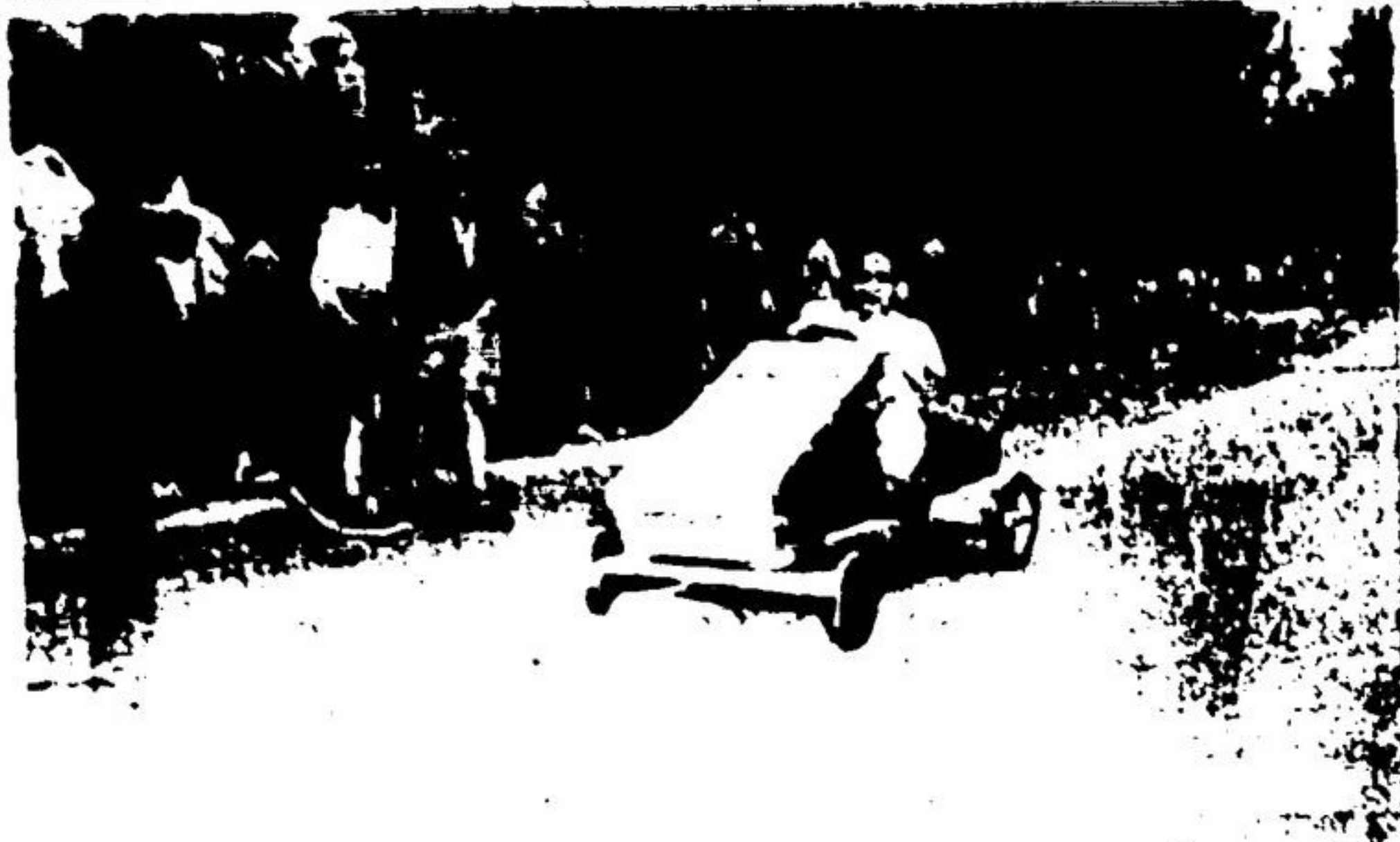
HEADING FOR THE FINISH LINE in the soap box derby is T. Quennell, pictured out in front with Keith Tarrant in the rear. Each class was run in heats with two cars in each heat. The elimination process was in use with the finalists competing for the cup.