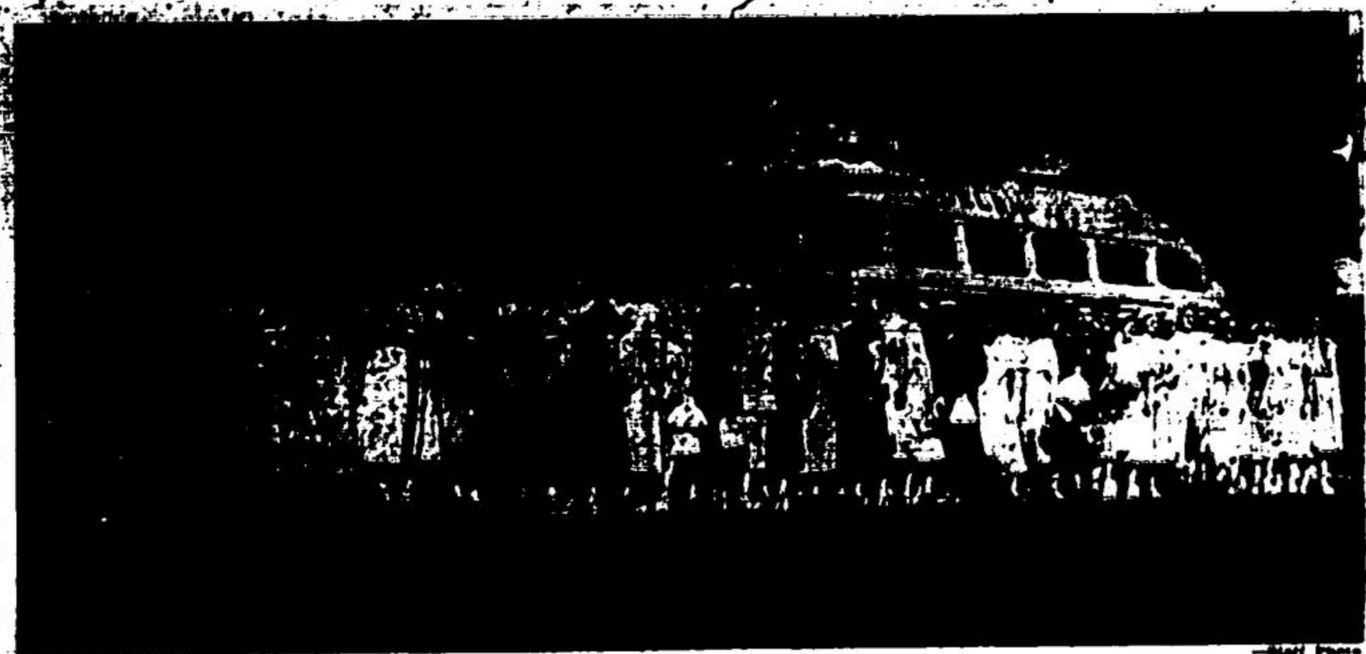
BANNOCKBURN WOMEN'S INSTITUTE enjoyed their annual bus trip last Thursday including visits to the St. Lawrence Starch Co., Hanlan's Point and the Maclean Hunter Publishing Co. The group of 37 ladies also visited the historic Dalziel Farm at Edgerley concluding their trip with dinner at Edgerley Hall.