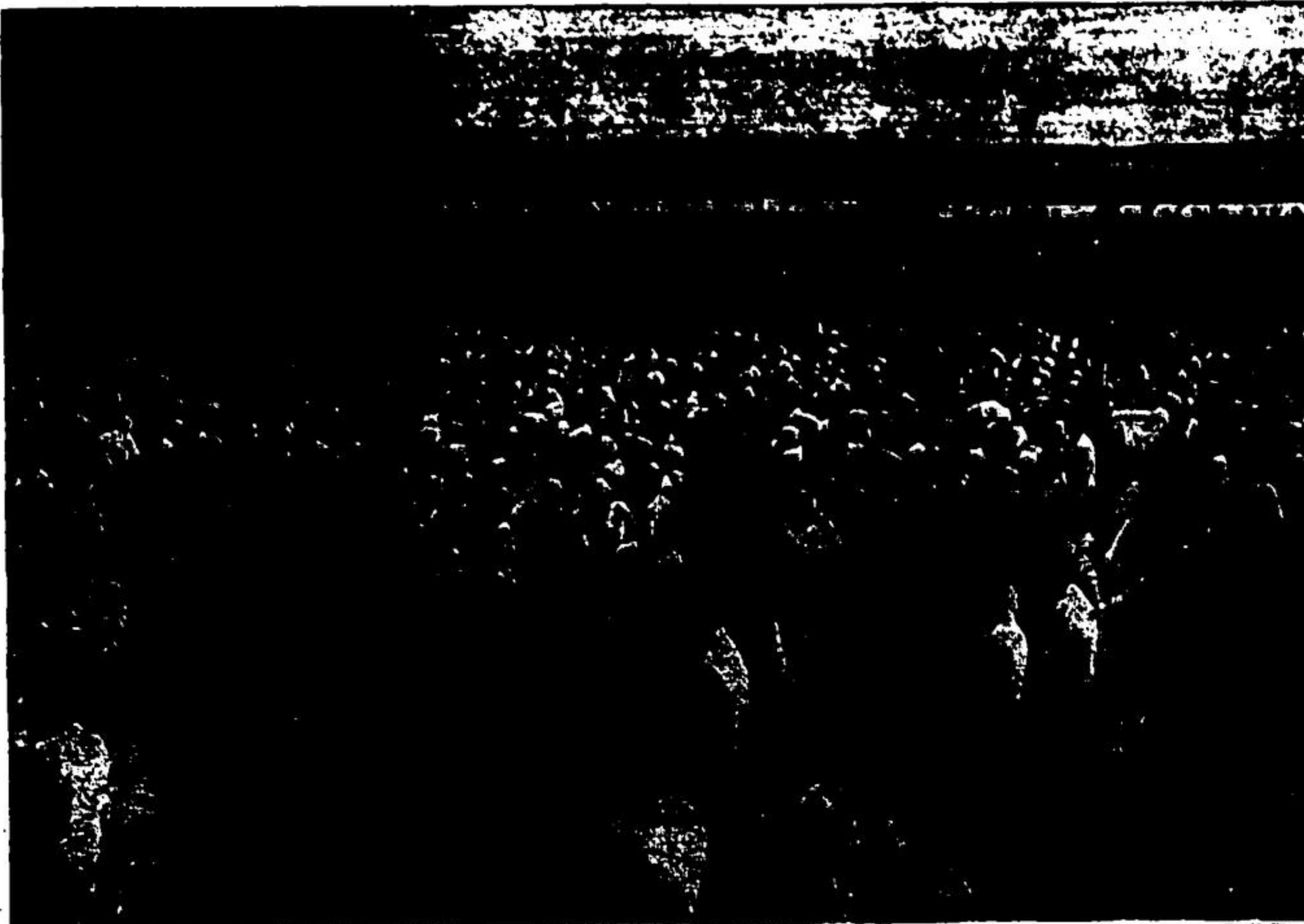
MANY ACTON RESIDENTS and former Milton people flocked to Milton over the week-end for the centennial celebrations, and above, a group is shown at the grandstand at the agricultural grounds during Monday afternoon's program. Despite heavy rain Friday and Saturday, most planned events were completed. The horse racing will be held Saturday, weather permitting.