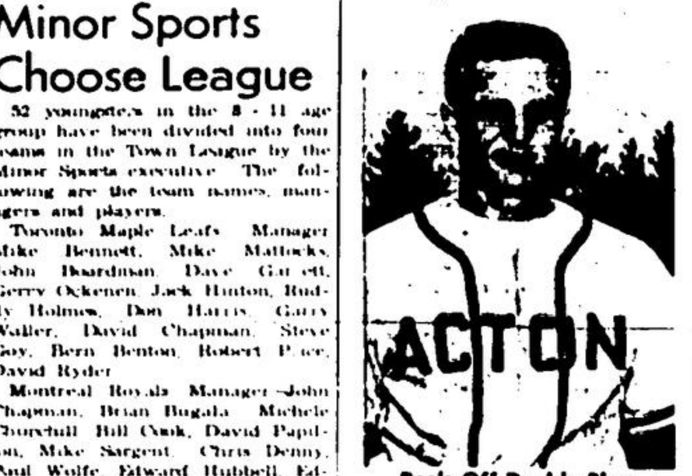
ACTON Reels Off Double Play