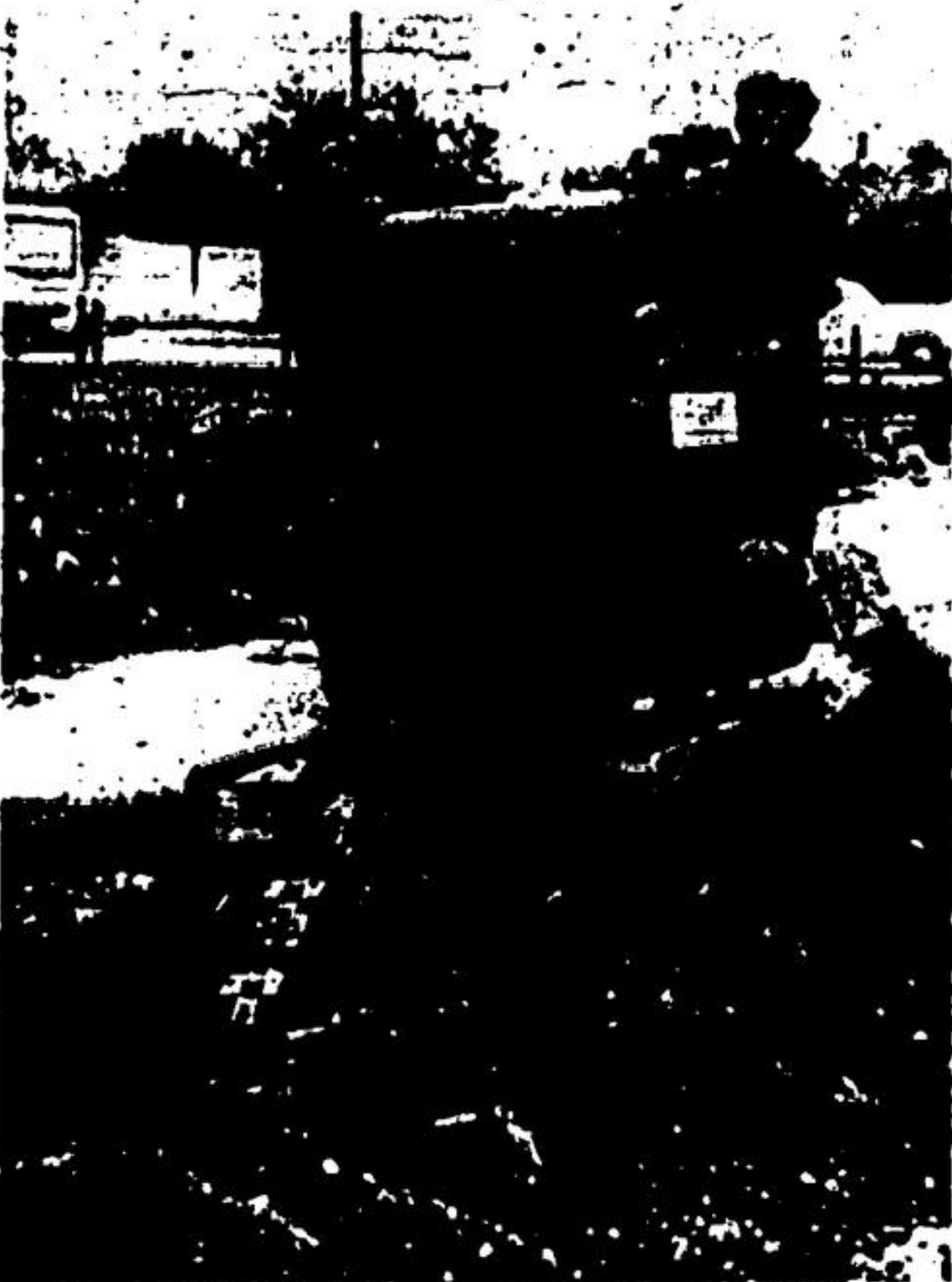
Warren Grove. The United Suburban Gas Company, has been installing trunk lines into Warren Grove the last two weeks. Shown above is one of the workmen operating the trenching machine.