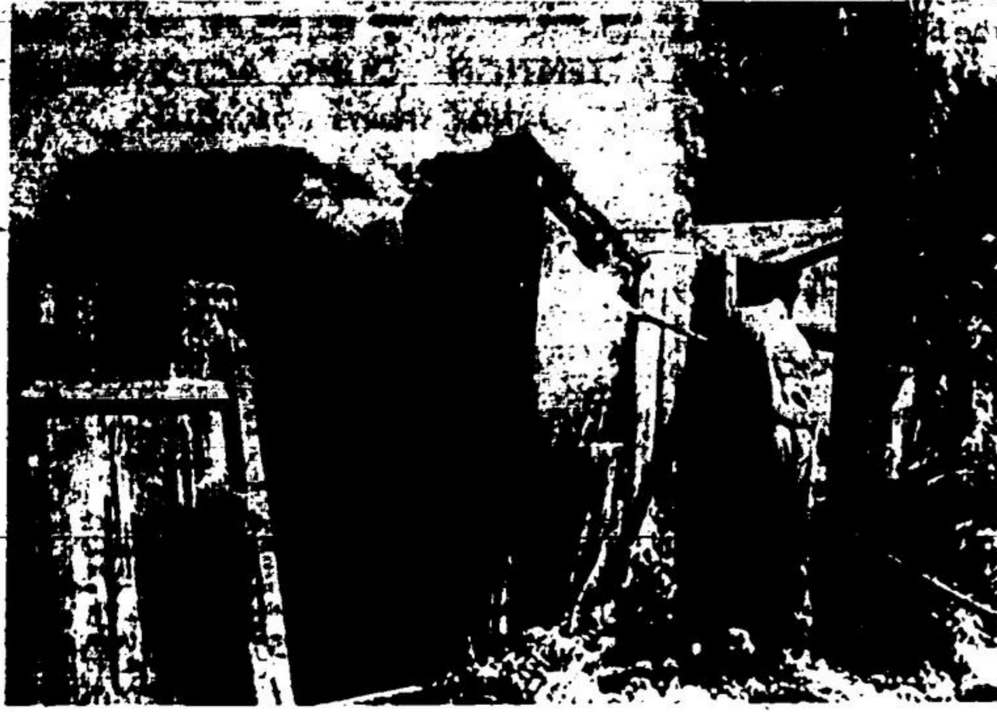
Friday Fire Soon Stopped

Last Friday, firemen were summoned not far from the fire hall to extinguish a blaze in a small shed adjacent to the fire hall. Quick action on the firemen's behalf resulted in little damage.