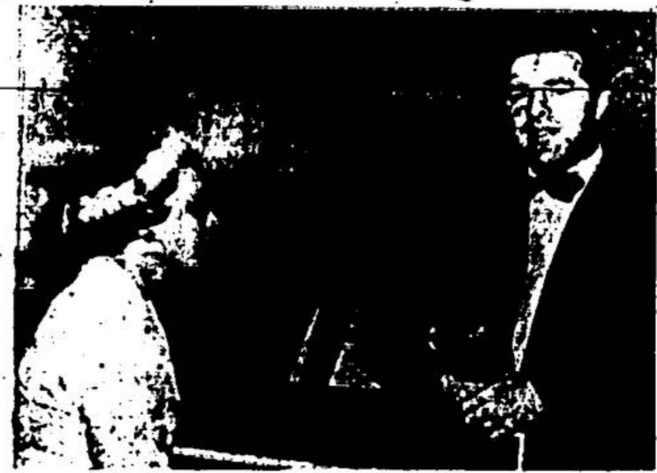
Men's Supper At Eden Mills