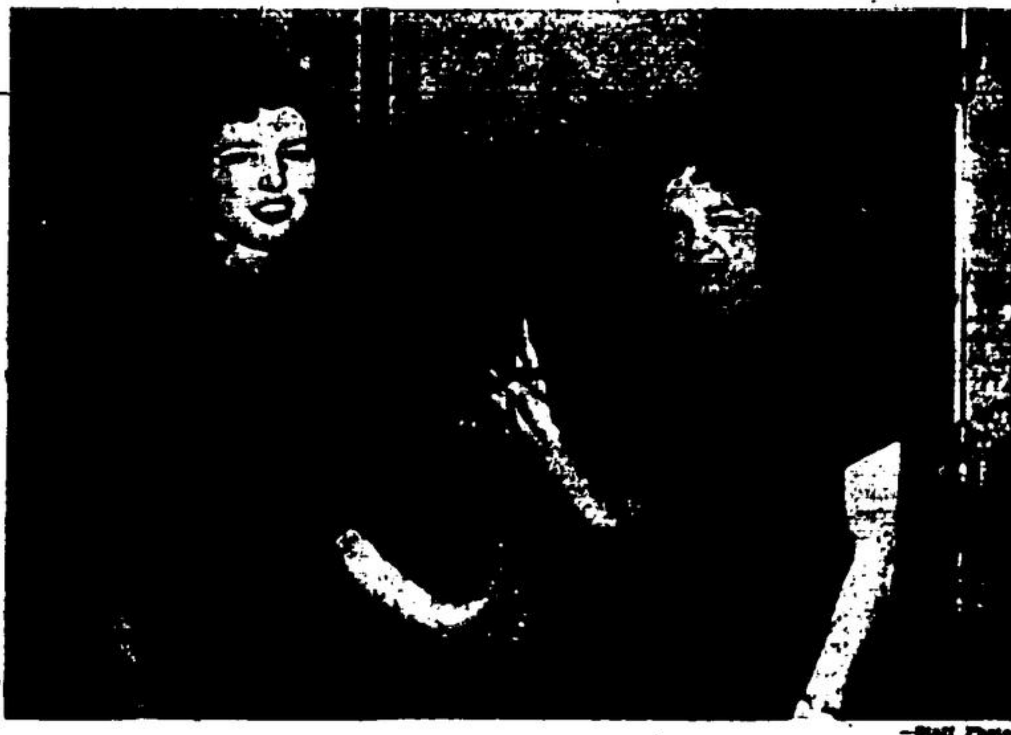
Girls Display New Bank Vault