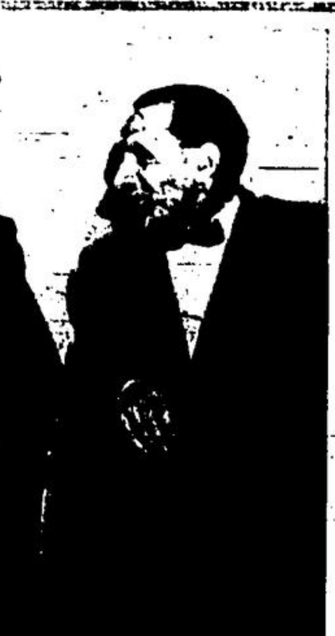
Officials Chat During Open House