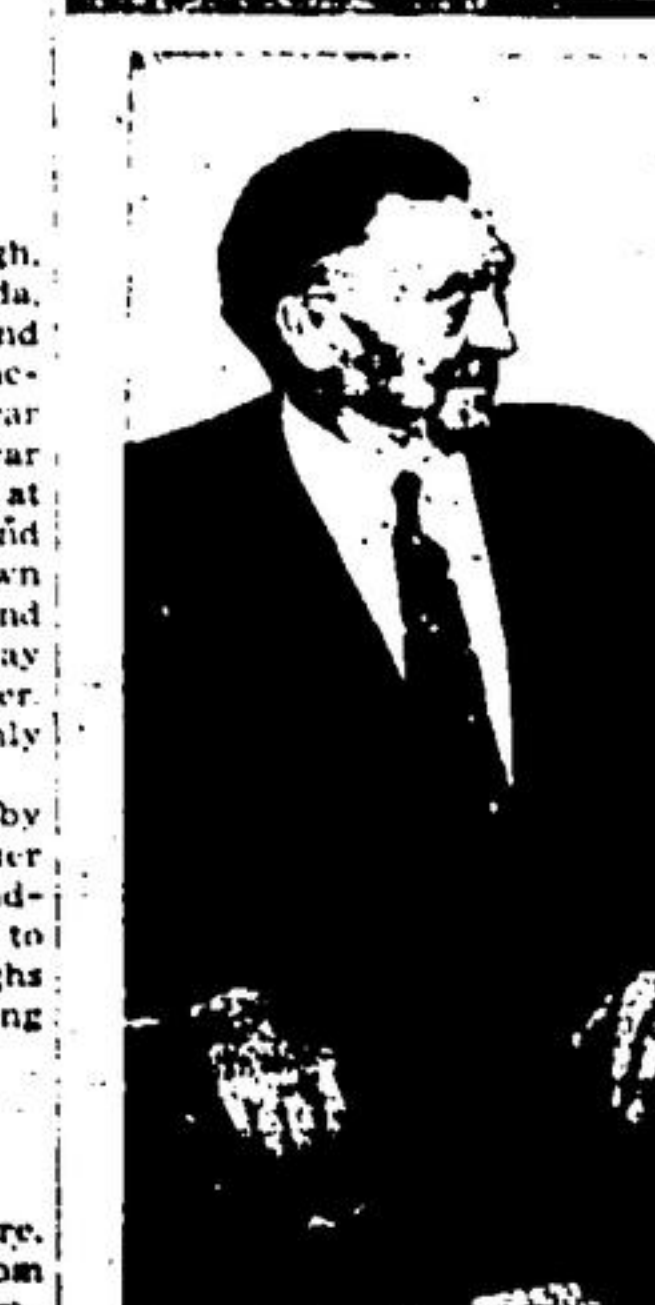
Officials Chat During Open House

Police report a break-in at Acton public school on Monday night. According to police, thieves entered through a window at the rear of the school. A projector, microphone and $25 in cash, which the children had collected for the Red Cross Society, were taken. Police are continuing their investigation.