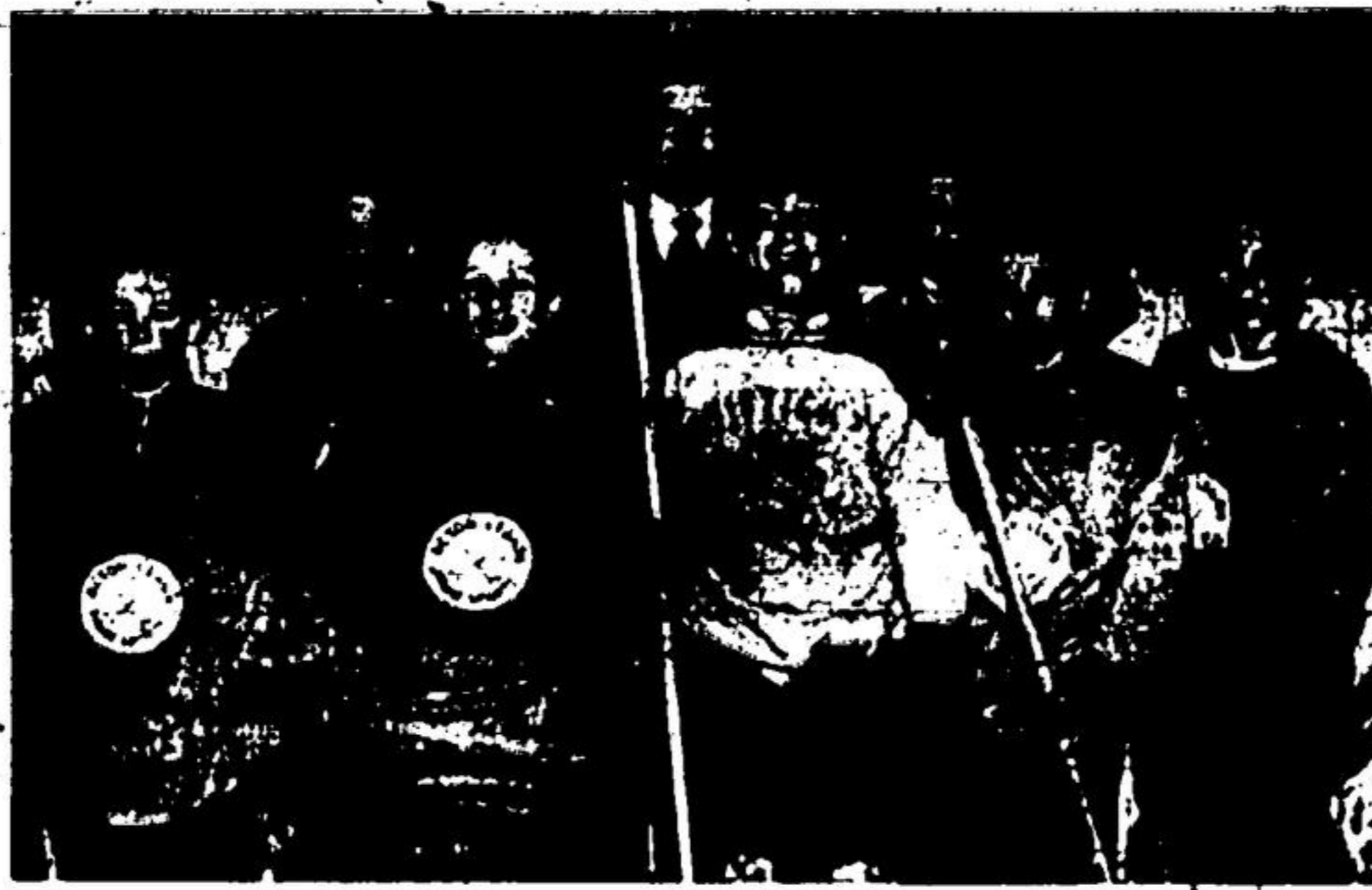
Cleveland Indians On the A.H.L. Warpath