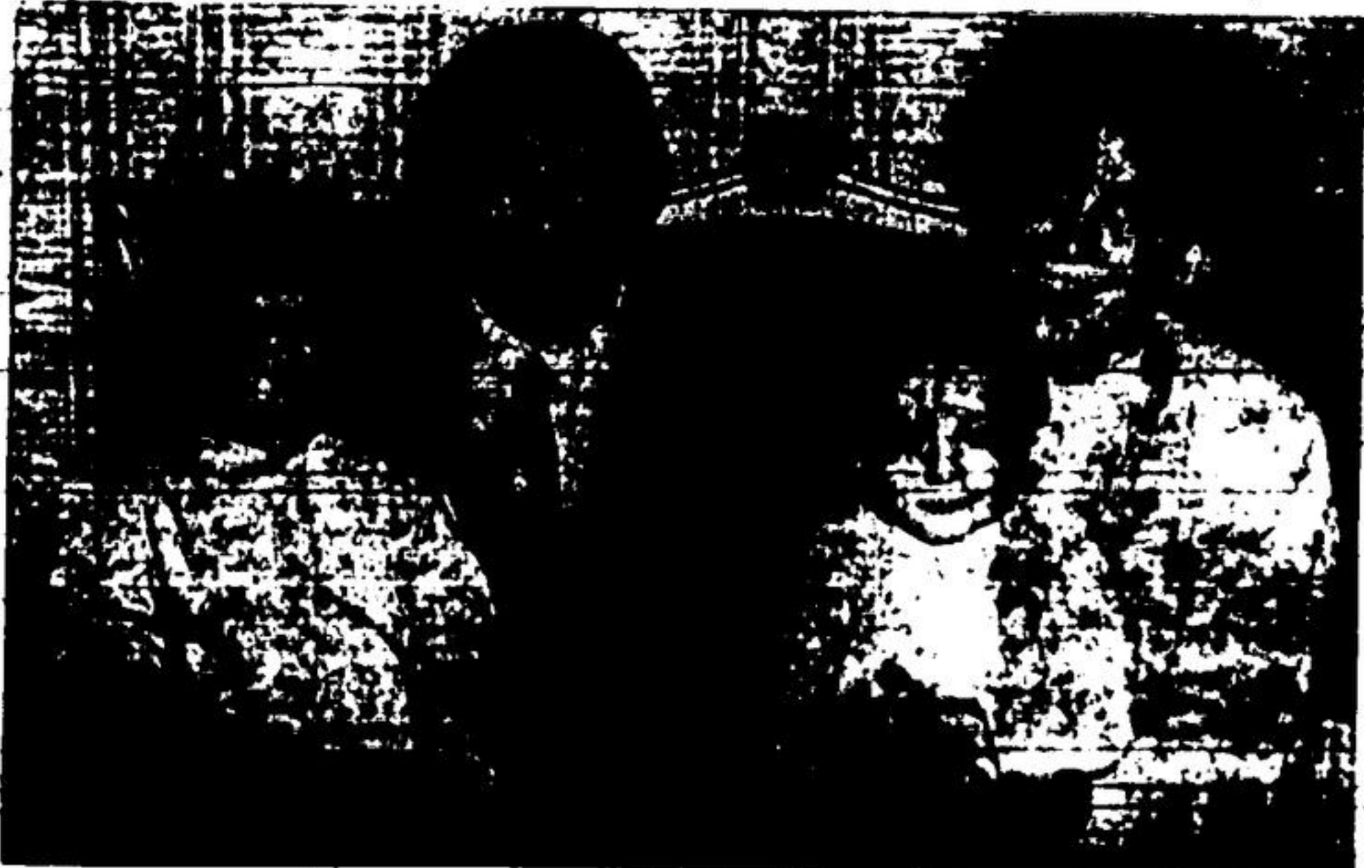
Refugee Family Happy in New Home