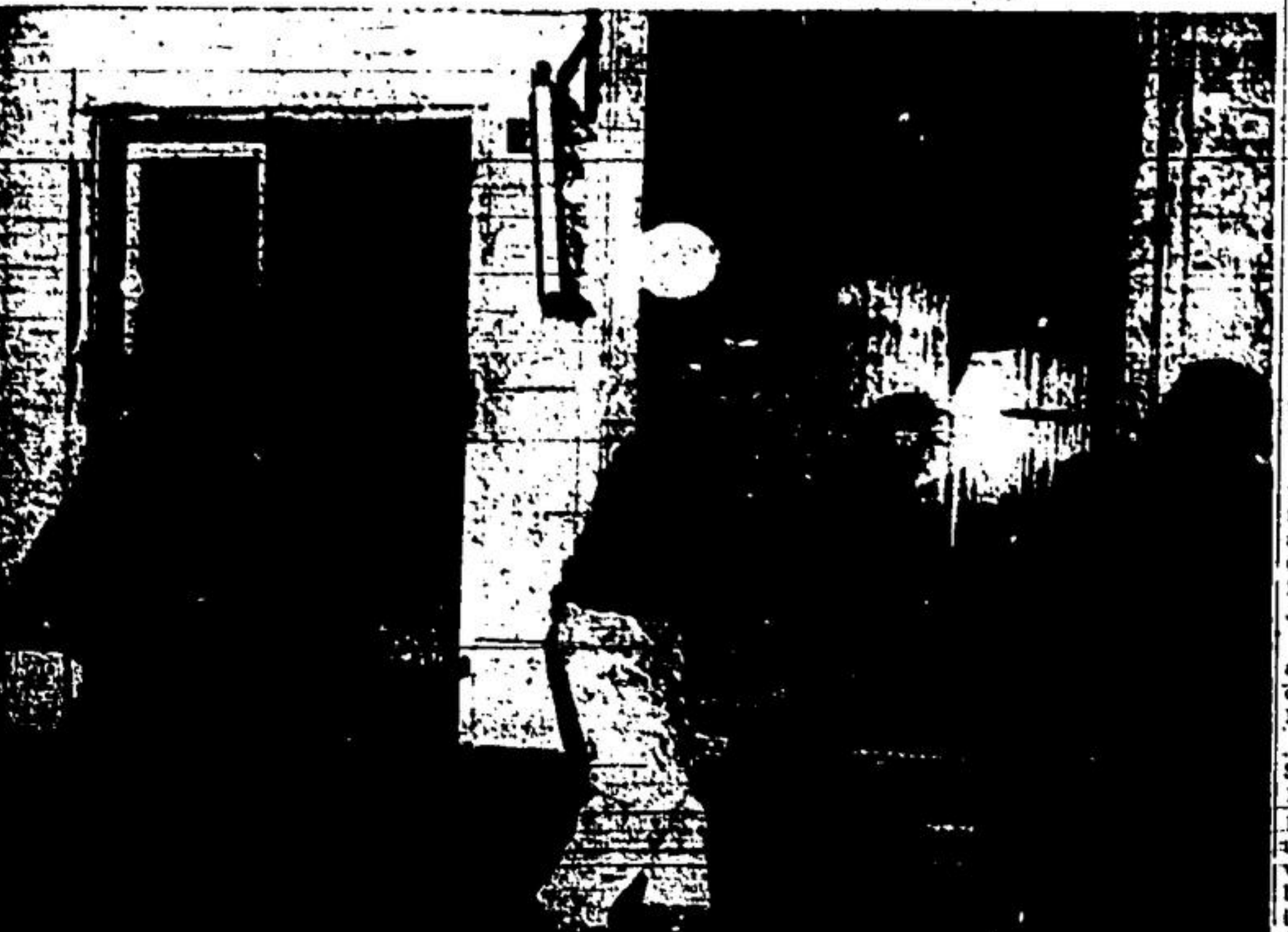
FURNITURE AND FILING cabinets were saved from the insurance office of Bert Woods, as the fire subsided enough to allow firemen inside the ground floor office. Water and smoke damage was great.