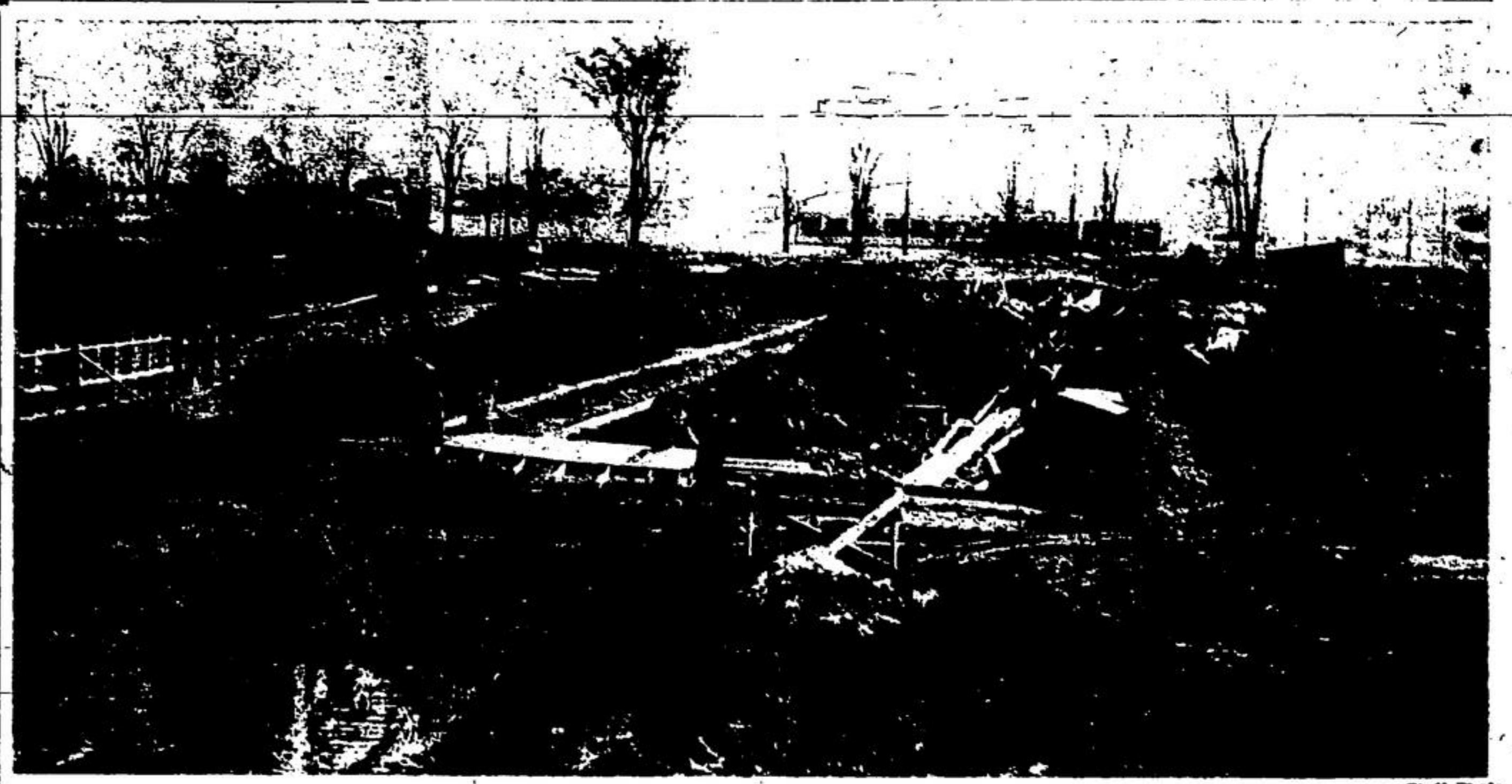
NEW SIX-ROOM PUBLIC SCHOOL, the M. Z. Bennett school, is well under way this week with concrete footings completed yesterday. In the background, right, is the high school and newly-paved

Acton Boulevard, which will be extended around the new school, stretches out at far right. The school board is hurrying arrangements to have a six-room addition approved for a 12-room school.