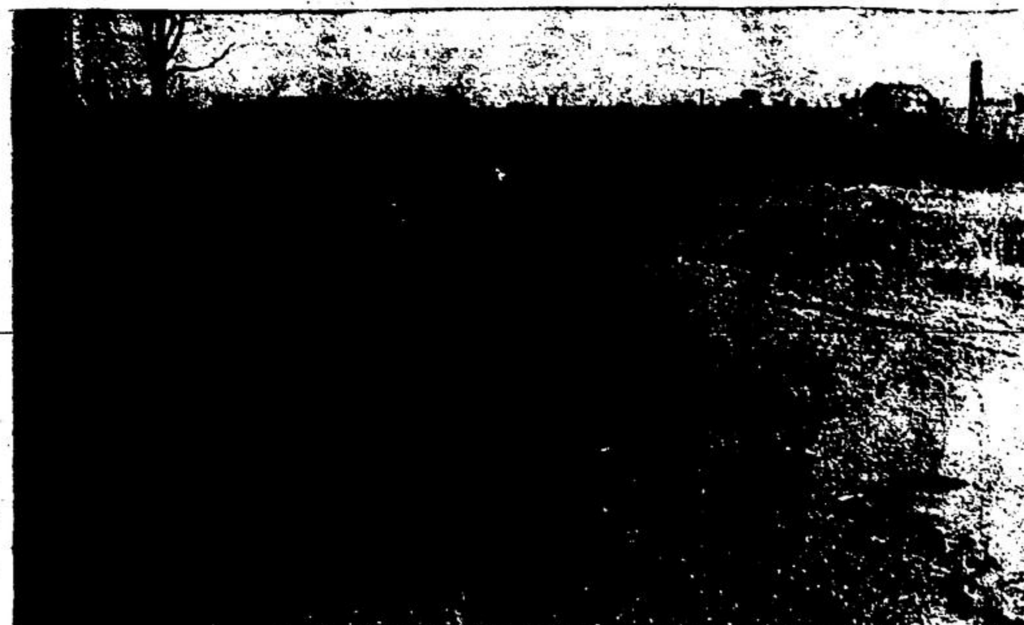
BAD WATERMAIN BREAK on Churchill Road Tuesday night not only caused water cut-offs to homes facing the road but put the street for over 100 yards out of use. The road was undermined in at least two spots with large cracks breaking the top and sinking the surface. One car, above, became snarled despite warning lights and barriers put up shortly after the costly trouble was discovered.

Acton Boulevard, which will be extended around the new school, stretches out at far right. The school board is hurrying arrangements to have a six-room addition approved for a 12-room school.