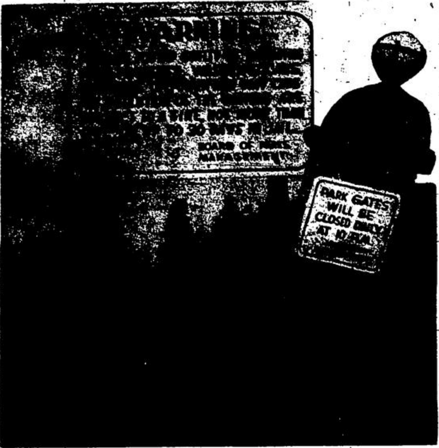
PARK BOARD RULES, designed to reduce damage and misuse of facilities at Acton Park, are sprouting out on signs this summer at conspicuous locations in the park. Shown in the composite photo above are two of these signs erected by the Board. Other signs restrict speed and direct parking in the increasingly popular park.