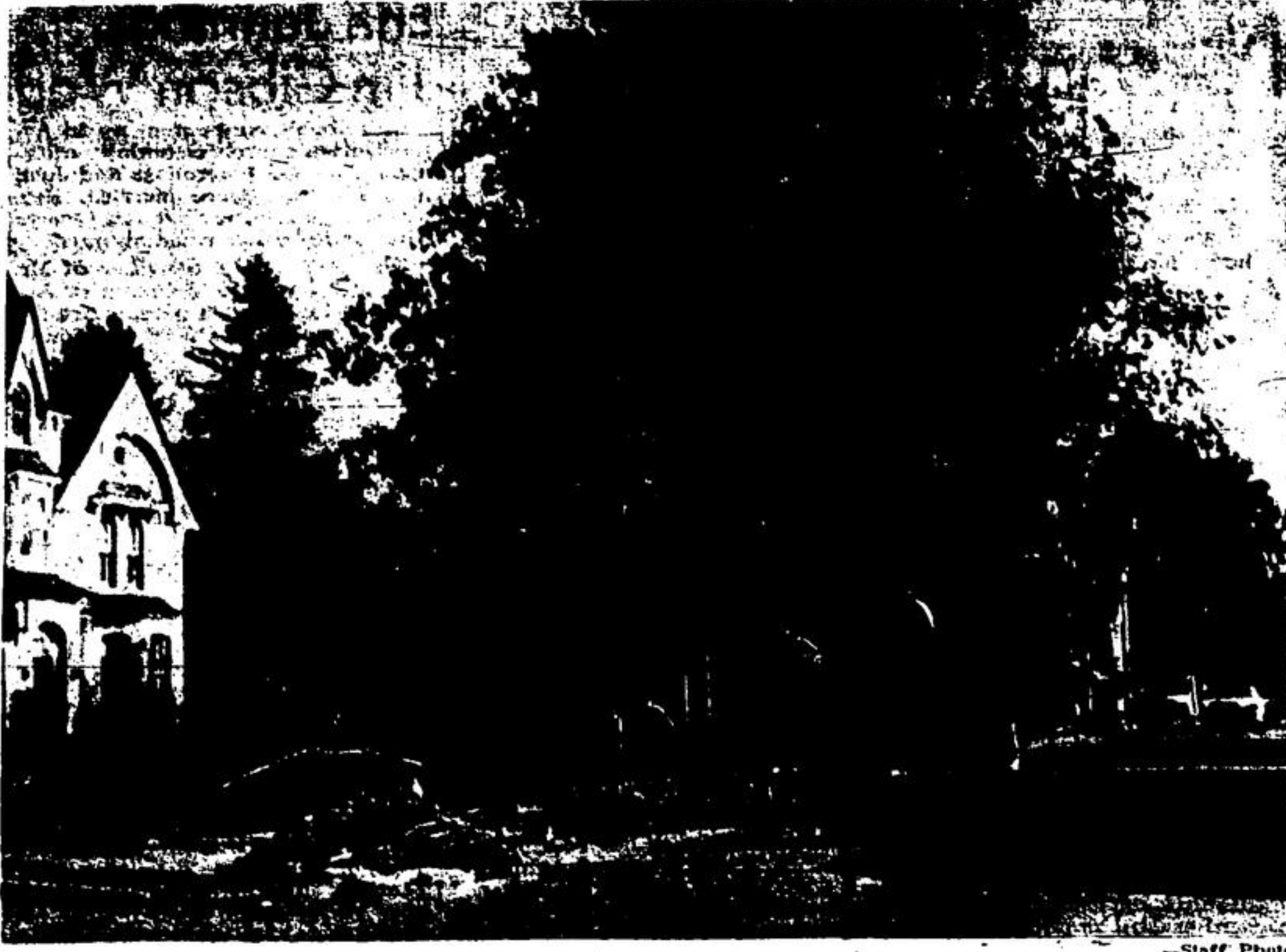
THE FOUR STURDY MAPLES in front of the Rumley Funeral Home gave way to progress this week. Little more than a day after this photo was taken all that remained was four dismembered trunks as the need for wider sidewalks, gas line installations and metal light standards dictated this noticeable change in the appearance of downtown Mill St. Town employees' axes and saws are starting work.