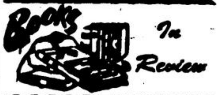
ALBERT SCHWEITZER: AN INTIMATE PORTRAIT

A grant of $10 was given to Hillsburgh Horticultural Society. Accounts passed included general $375.94, relief $135.20 and roads $4,281.76.