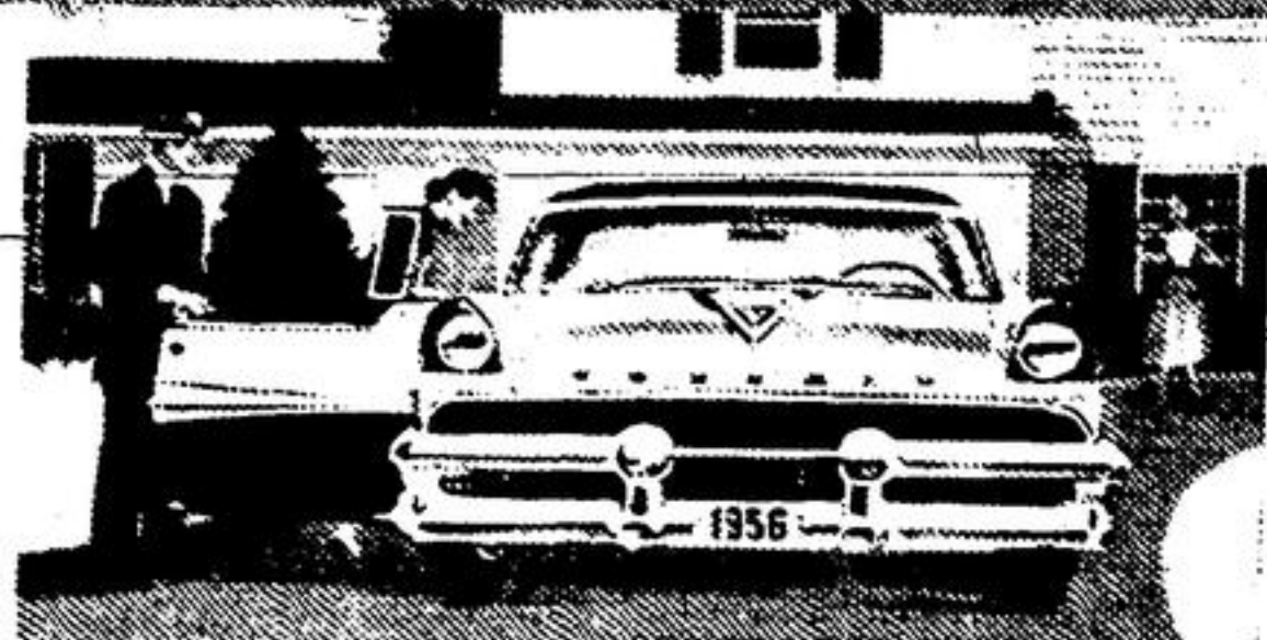
WHERE A FINE CAR MATTERS, MONARCH BELONGS