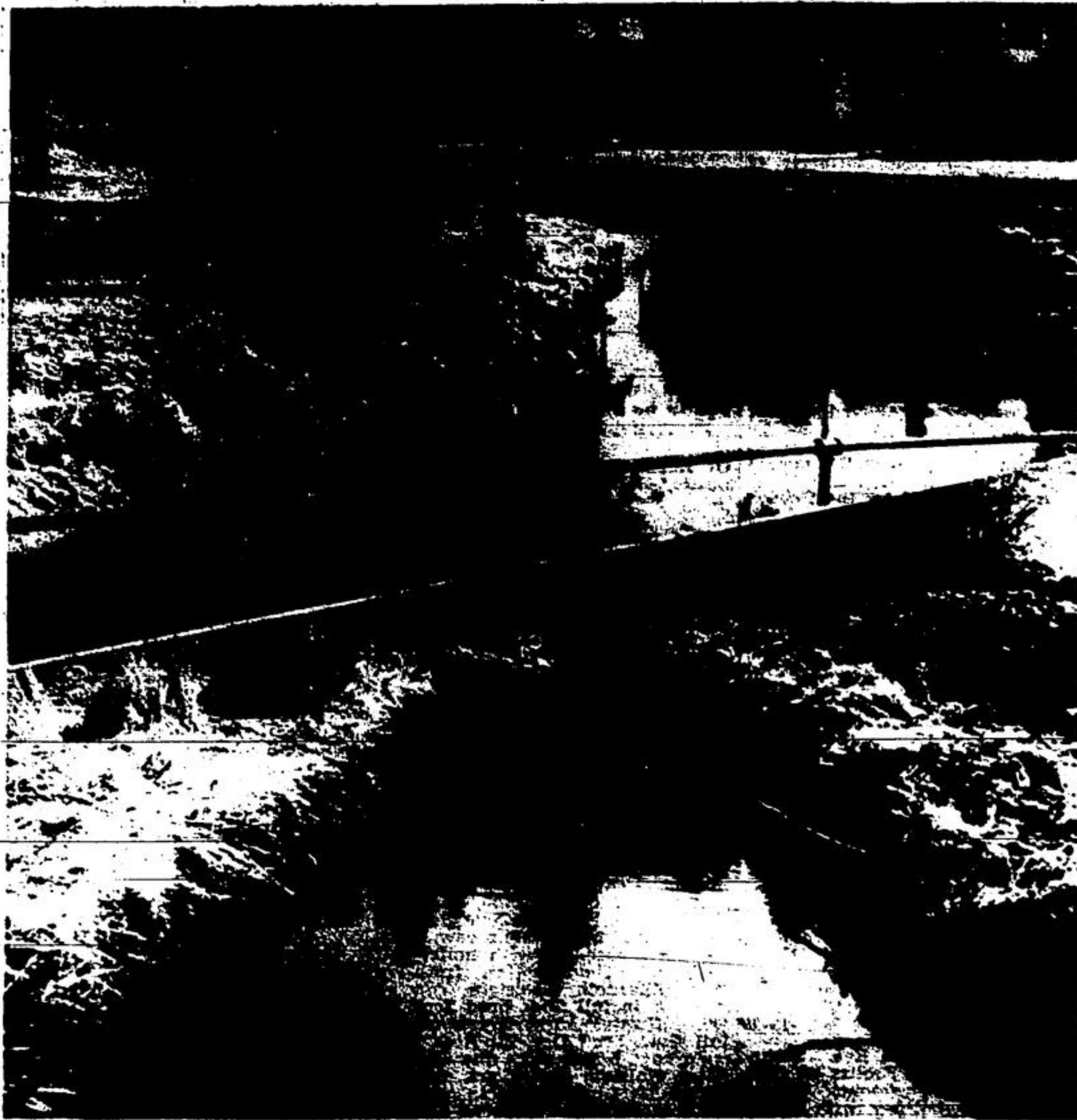
THE SCHOOL CREEK , a growing problem for recent Councils as silt built up the bottom and hampered drainage flow in the Main St. area, was given a major overhaul this autumn from the school to Fairy Lake. The town widened the creek to over 10 feet, also increased the depth. Further drainage work is planned for next spring in this section of town.

1955 for Acton was a year of unprecedented growth, a year of pace-setting progress that will keep 1956 moving to better it. The town's boundaries were enlarged by 465 acres; its population rose by over 300 new citizens; more than 100 new homes took shape in three subdivisions and on private lots; assessment rose to over $3,000,000, almost a quarter of a million above 1954; established industry carried out expansion plans; three natural gas companies competed for rights to serve the town and area's potential consumers. All these and other factors moulded the year's progress. At the top of the page are photos taken at the 240-lot Lakeview subdivision (left) and at the 200-lot Glenlea subdivision. At right service installation work, undertaken by the town, moves ahead into the 14-lot Cobble Hill subdivision which was completed this year. Now nearly 60 houses are occupied at Glenlea, many more near completion. At the Lakeview subdivision many of the first block of 28 homes are finished or nearly finished.