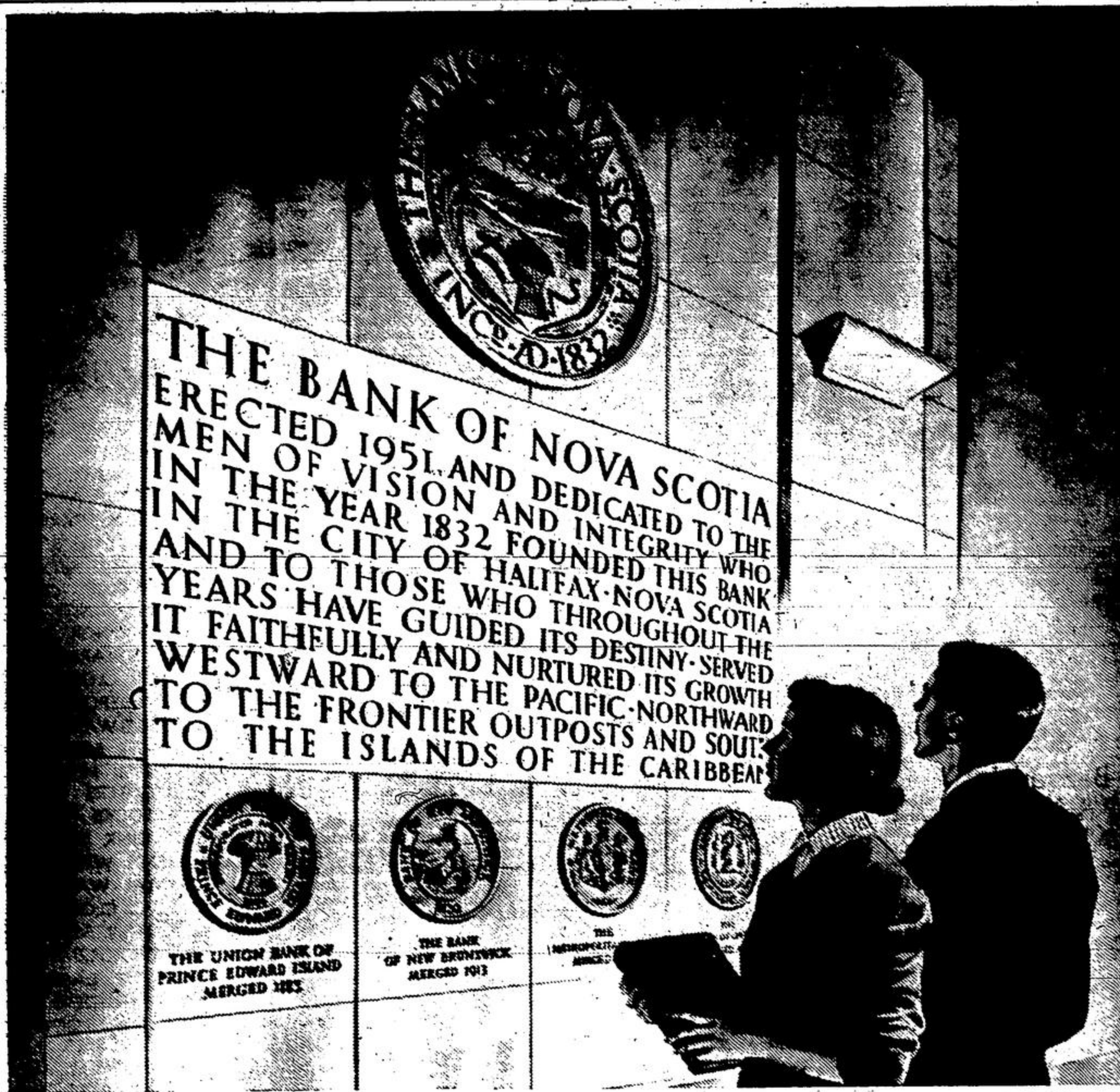
Inscription in the lobby of The Bank of Nova Scotia Building, Toronto—visited by thousands of young persons every year.