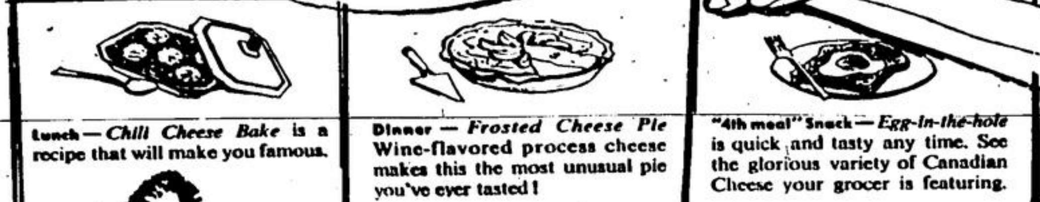
Lunch - Chili Cheese Bake is a recipe that will make you famous.