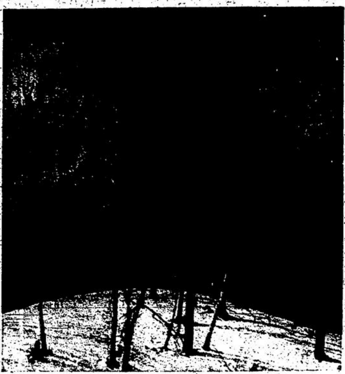
BIRCH IN THE SNOW, impaled in a sun-flooded knoll off No. 25 Highway between Acton and Milton, throw long shadows across the white ground covering beneath them.