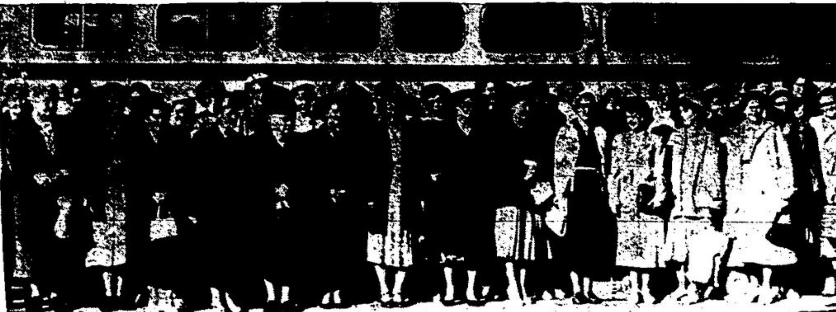
WOMEN'S INSTITUTE TOURS this summer and fall, from as far as W.A., Acton W.I., Dublin W.I. and Limehouse, Silverwood and Bannorth as Midhurst and south to Niagara Falls, were popular with neckburn W.I. members. With the exception of the latter group, local and district groups. Top to bottom are Balmfad W.I. and all tours started in Acton for the day-long informative excursions.