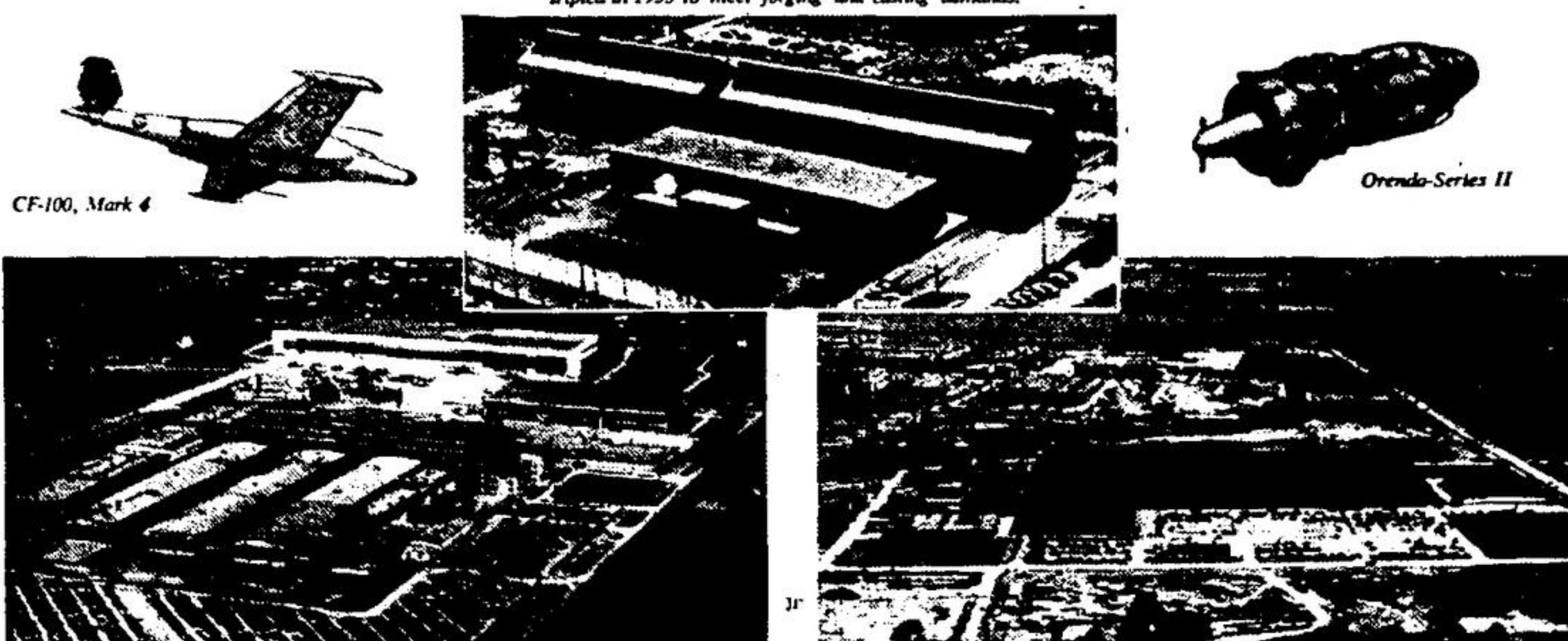
Avro Aircraft's multi-plant operation at Malton produces Mark 4, CF-100's for the R.C.A.F.

From Orenda's design, development and production departments came the first all-Canadian jet engine to power the CF-100 and F-86 Sabre V and VI. Through constant development, the various series of the Orenda, now at 11 and 14, have increased in power and reliability. In addition to the present extensive design, engineering and experimental offices and laboratories at Malton and a full scale test plant at Nobel, Ontario, expanded research facilities are now under construction to deal with the increasing... complex requirements of the future. The 6,000 people in the Orenda family are dedicated to designing, manufacturing, maintaining and servicing modern jet engines and other forms of aero power and to the building of a sound aircraft industry for the defence and development of Canada.