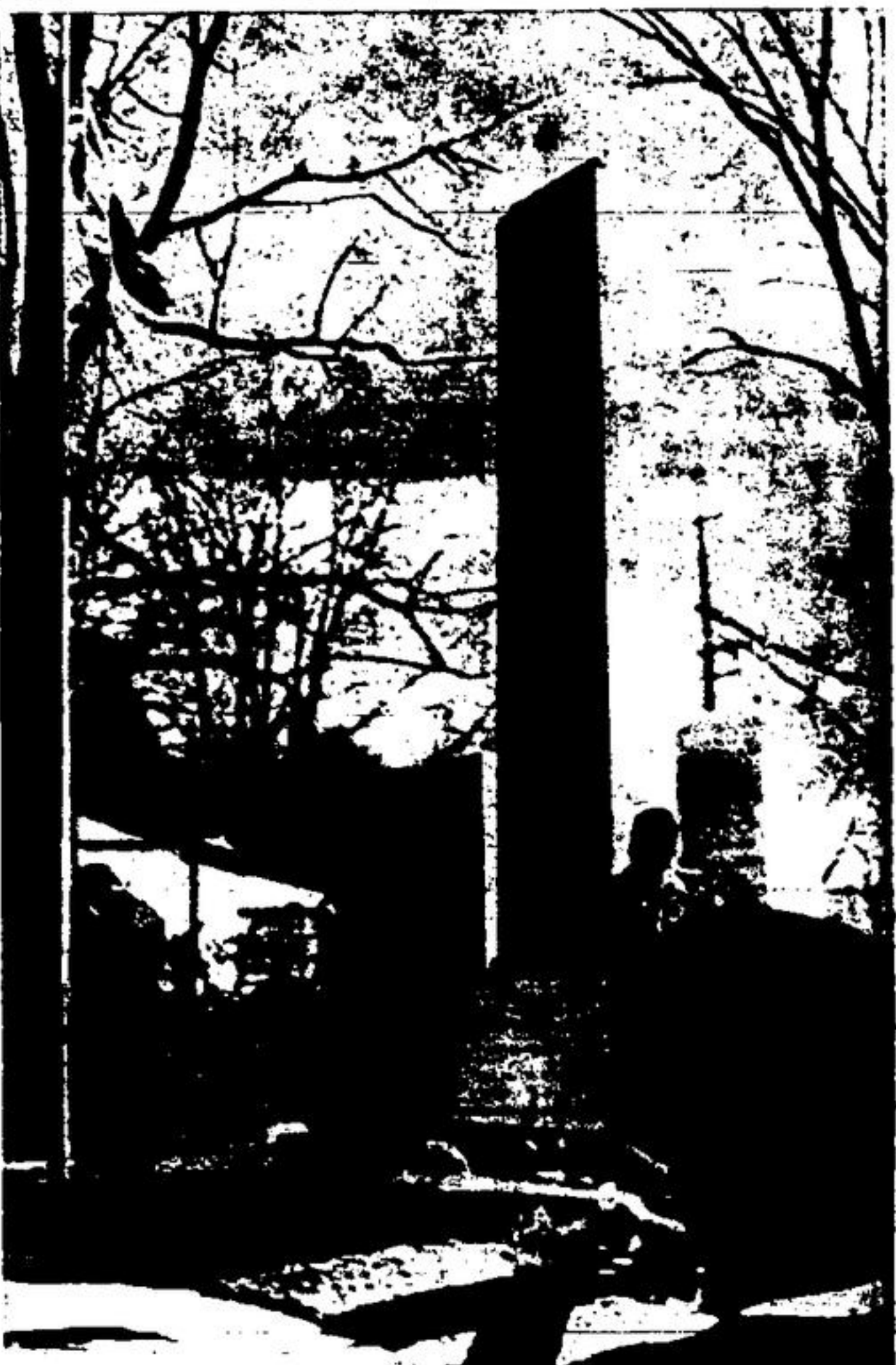
REMEMBRANCE DAY in Acton last Thursday was marked by a parade to the cenotaph and service in Knox church. Both services were well attended. Here the flag rises over the silent, bowed heads of the guard of honor while Reveille sounds.