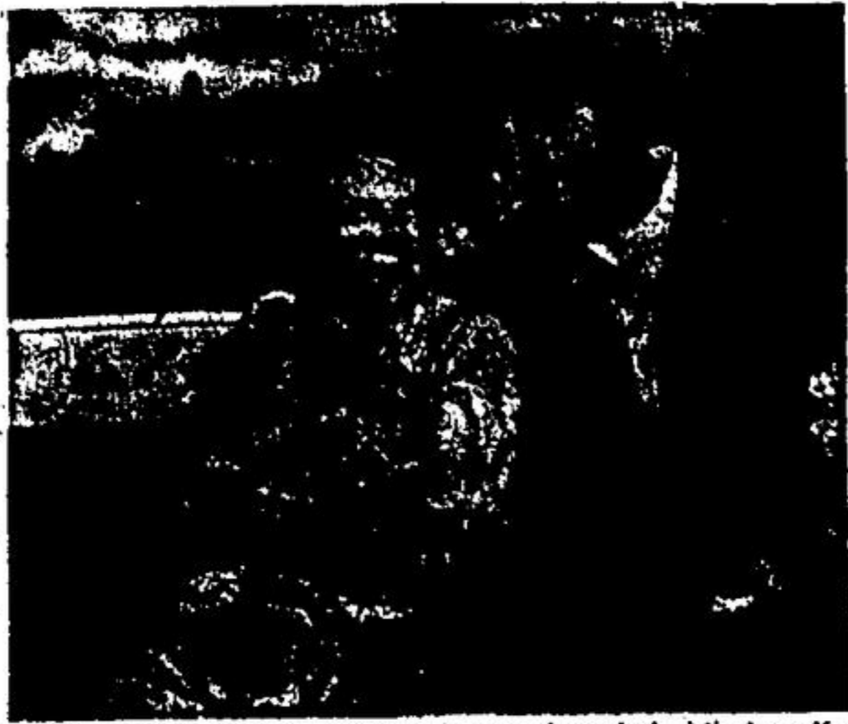
"MA AND PA KETTLE AT HOME" brings the whole hilarious Kettle clan back to the old homestead, and the result is everything their most ardent fans could ask for. The newest in the ever-popular series of Universal-International comedies is playing now at your Roxy Theatre. Don't miss it!