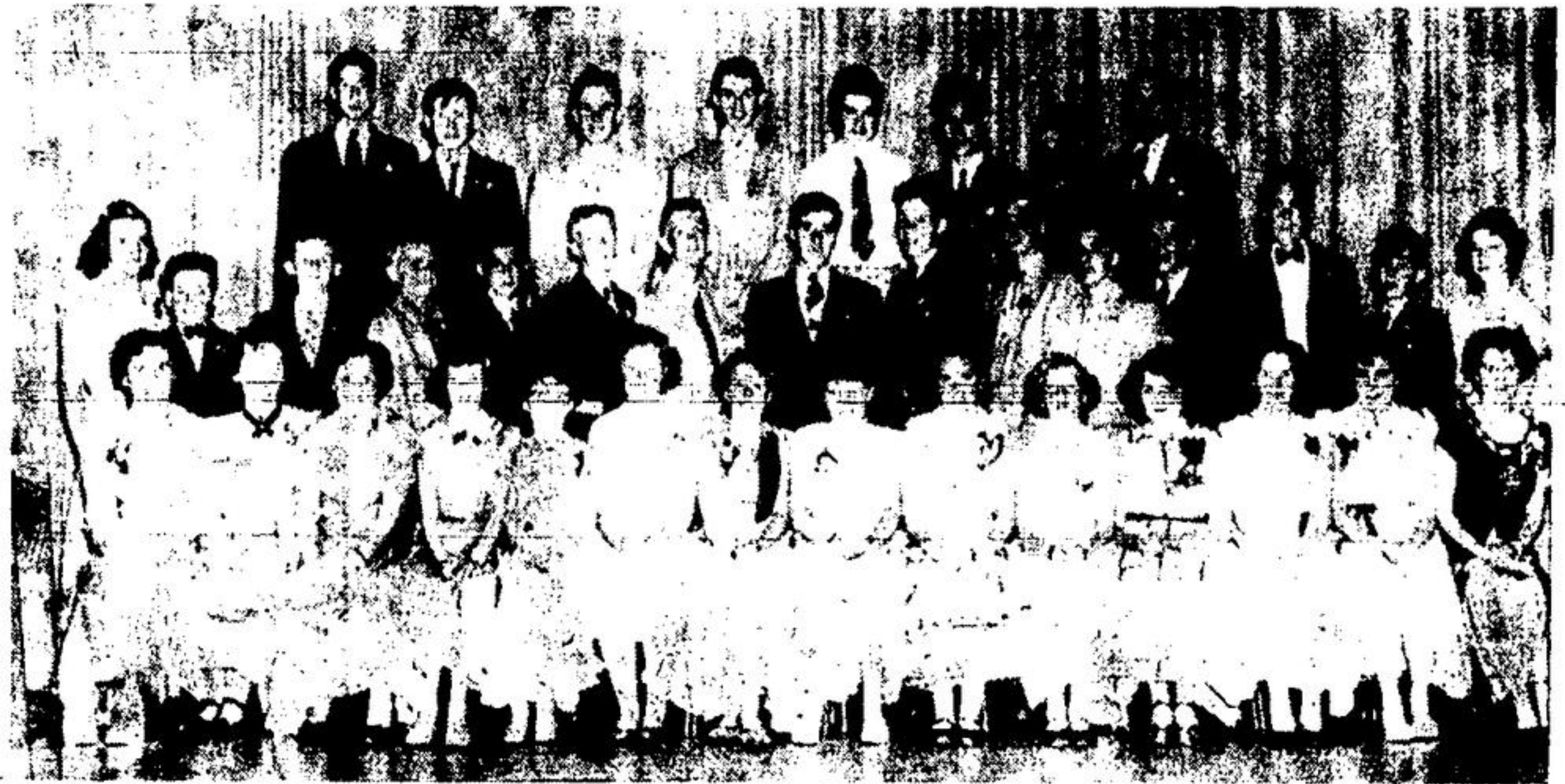
GRADUATING CLASS members of Acton public school were entertained at the annual banquet sponsored by the Home and School Association in July.