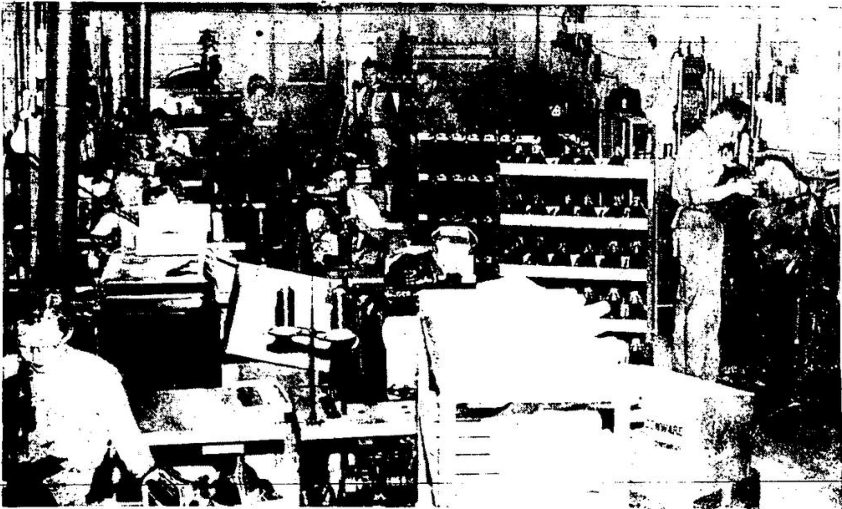
PRODUCTION INCREASES were being steadily made at the Corona Shoe Factory last year and the plant is pictured here in August. The town's newest industry was turning out 150 pair of high quality slippers each day for distribution to over 200 stores in Ontario.