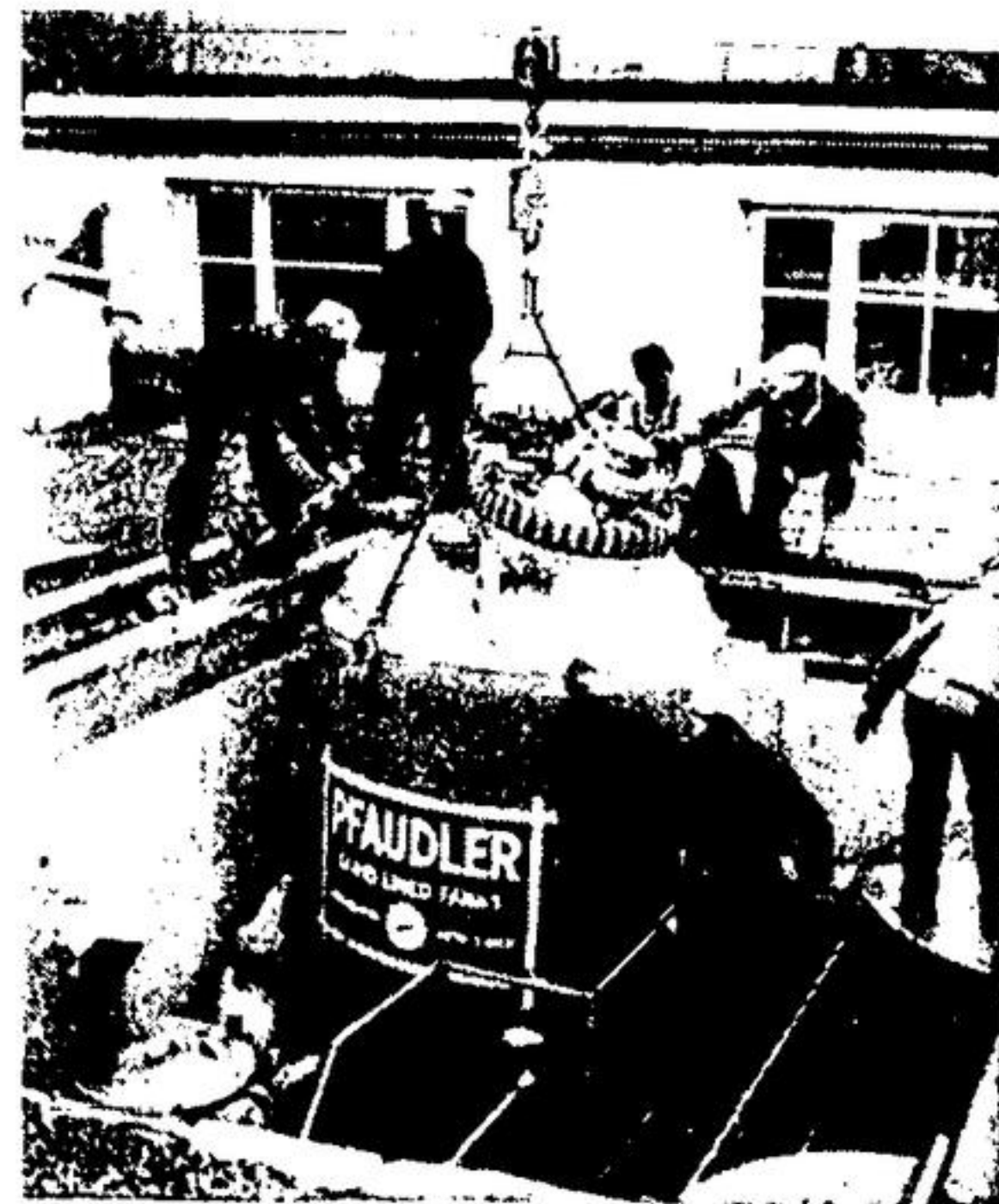
EXPANDING PROCESSES, Baxter Laboratories in March installed a glass lined 1,000-gallon tank for use in making an invert sugar solution. A hole was made in the roof to get this tank into place.