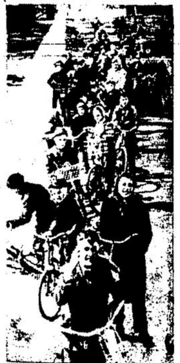
OVER 100 bicycles received reflective tape as Rotarians initiated the safety project in April.