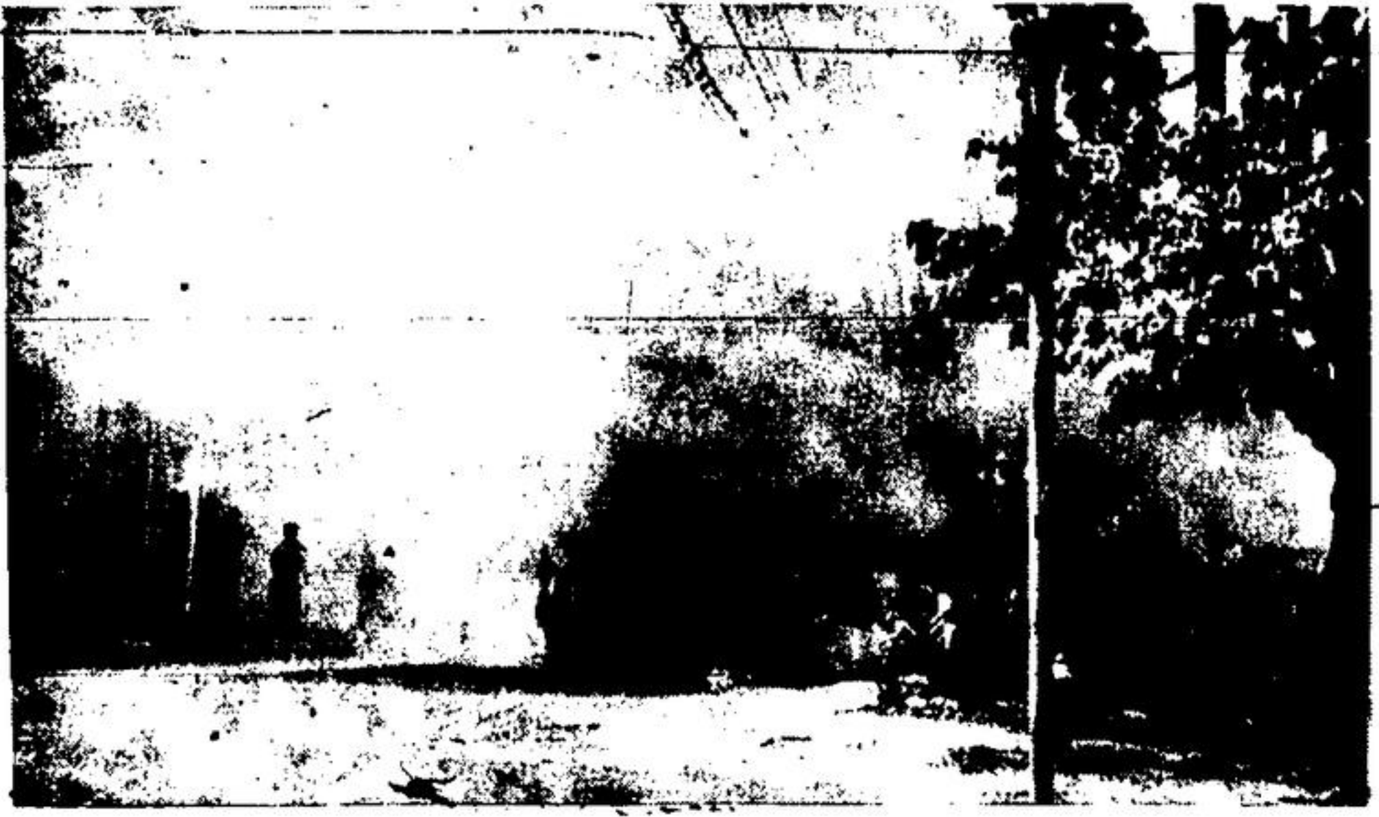
BUILDINGS WERE THREATENED and severe damage exerted in the year's most spectacular blaze one May afternoon when the road oil being spread caught fire and burned up John St. The operator on the back was seriously injured as he remained on the truck to shut off the oil flow.