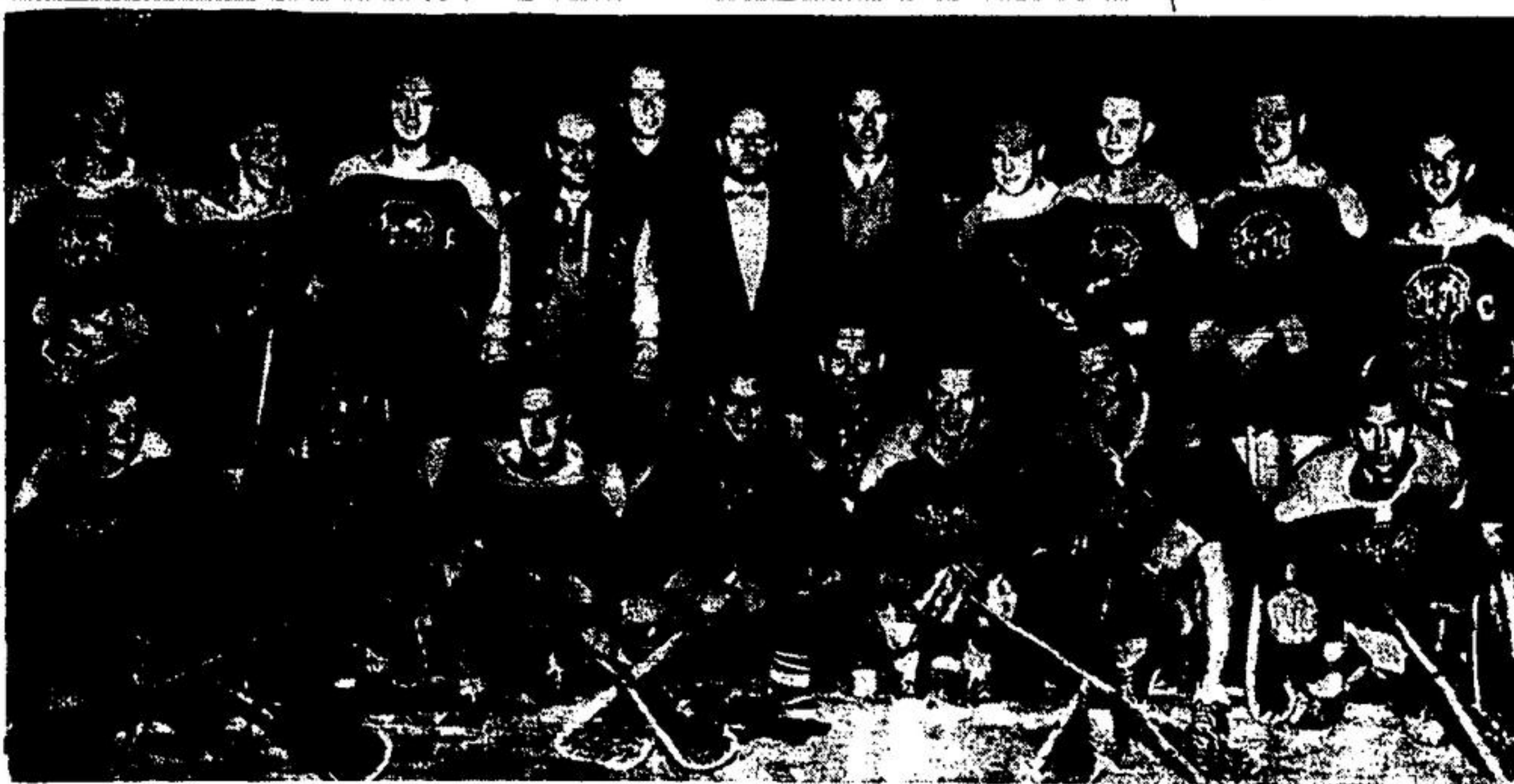
FINALISTS IN THE ONTARIO Lacrosse Association's Intermediate C series, Acton Rams came within a whisker of adding another lacrosse title this year but were shaded by Bradford in the finals.