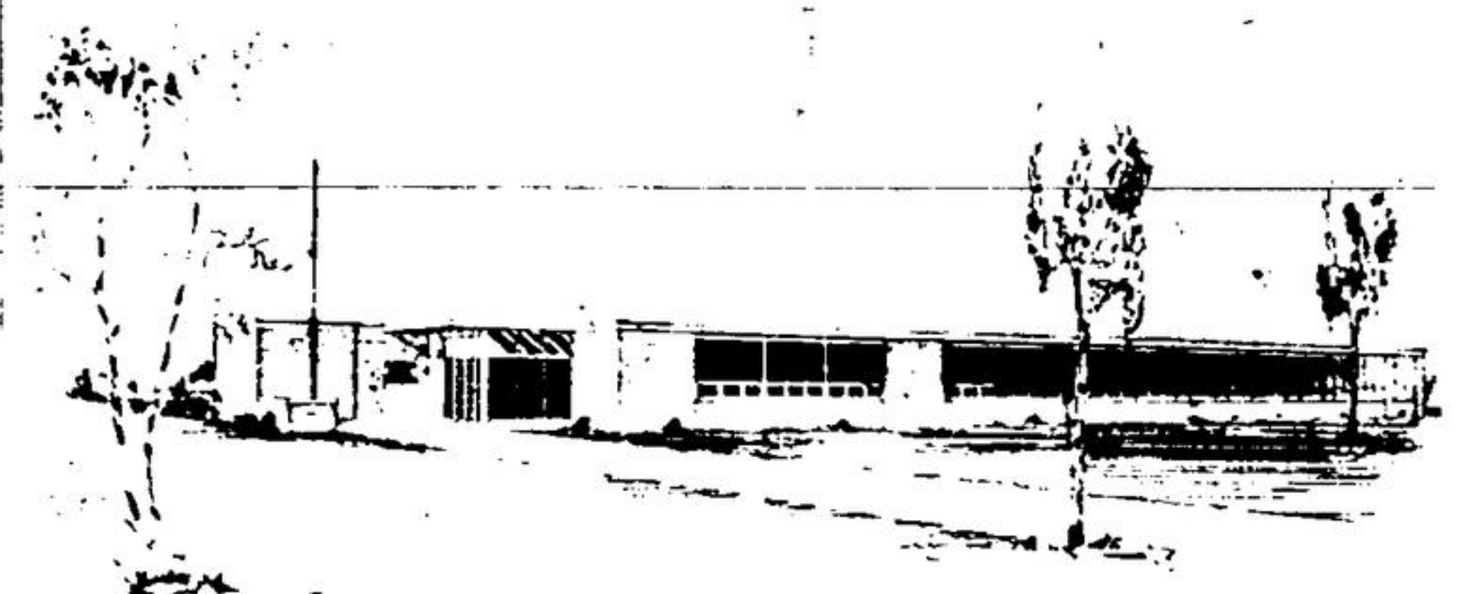
ARCHITECT'S SKETCH shows the new Acton high school now under construction on Acton boulevard. Good progress is being made and the roof is nearly completed according to local officials. The heating equipment will be put in place this week. Slabs of concrete will be placed ready for the window frames. It is hoped the building will be enclosed so construction can continue during the winter.