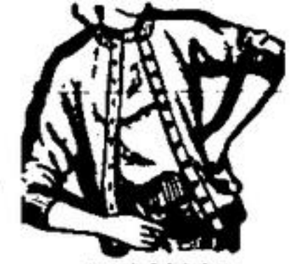
SWEATERS $3.95 UP