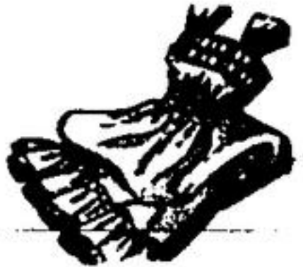
NIGHTGOWNS $1.98 UP