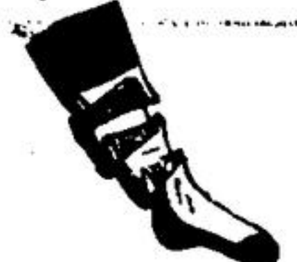
HOSIERY $1.35 UP