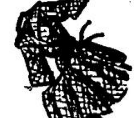
DRESSING GOWNS $5.50 UP