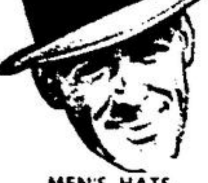
MEN'S HATS $5.95 UP

or a gift certificate with miniature hat