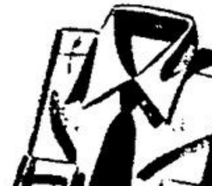
MEN'S SHIRTS $2.98 UP