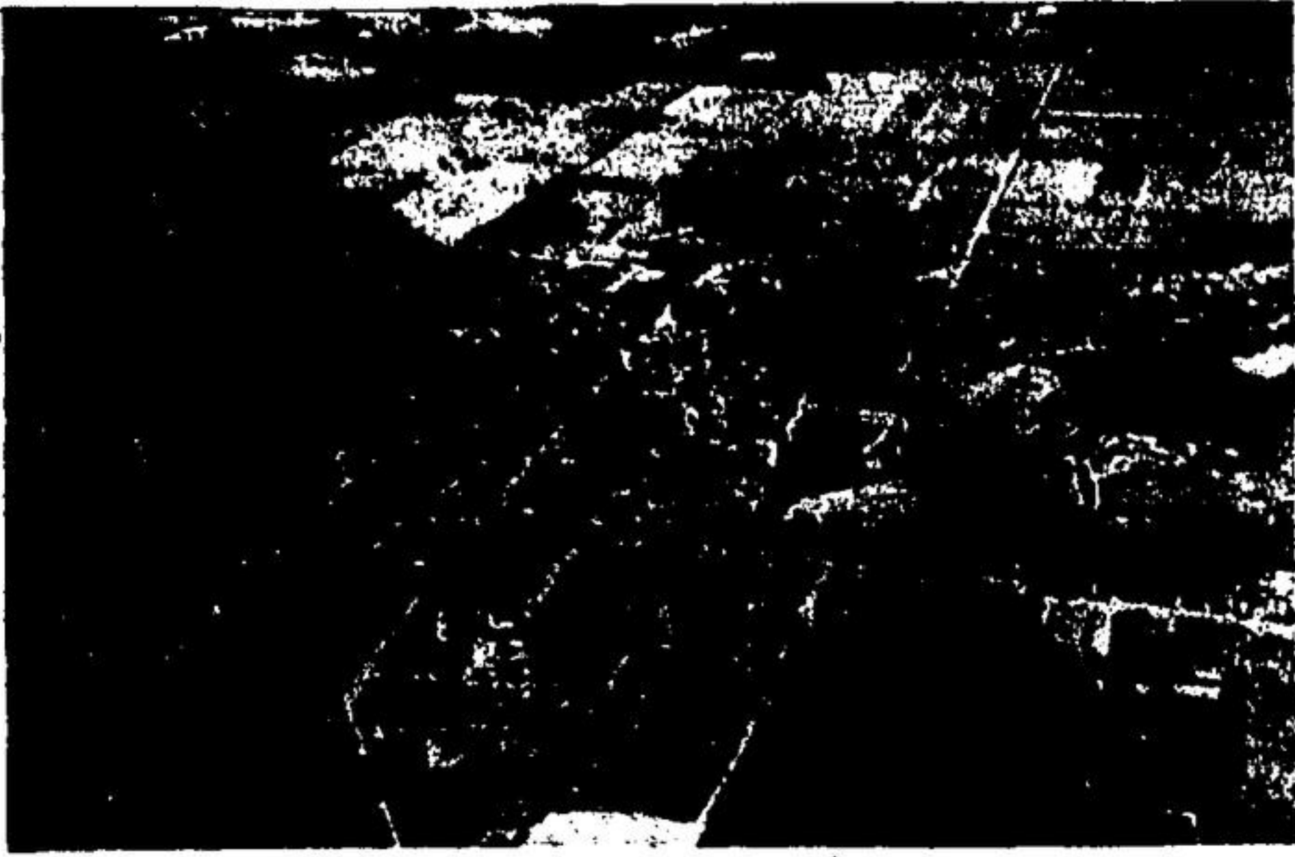
PLANS ANNOUNCED —on Wednesday night of this week by the Industrial Committee and approved by Acton council called for annexation of approximately 400 acres from Esqueping Township to the Town of Acton. The present built-up area of the town is shown here in an aerial view. A certain amount of farm land that appears in this photo would be included in the town if the Ontario Municipal Board approves the annexation plan.