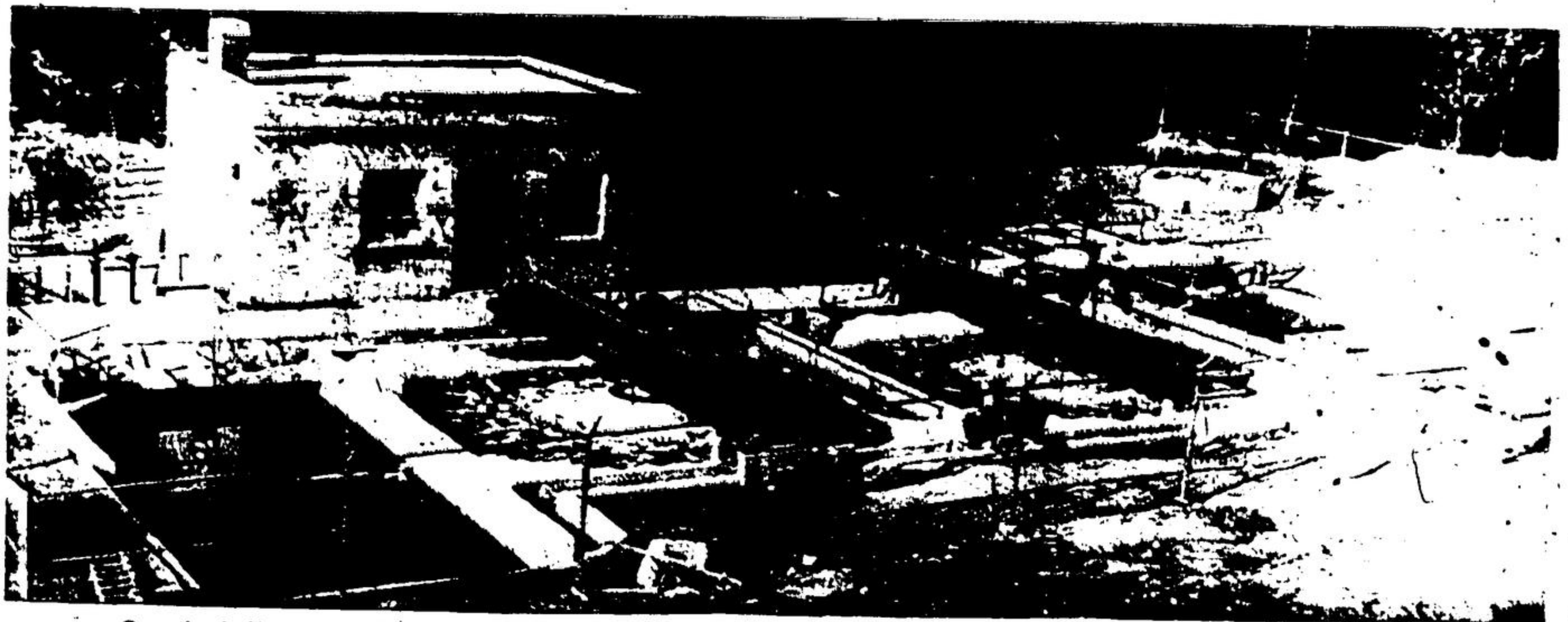
Operating in May, Acton's Sewerage System added the town's largest debenture indebtedness and completed two years of construction