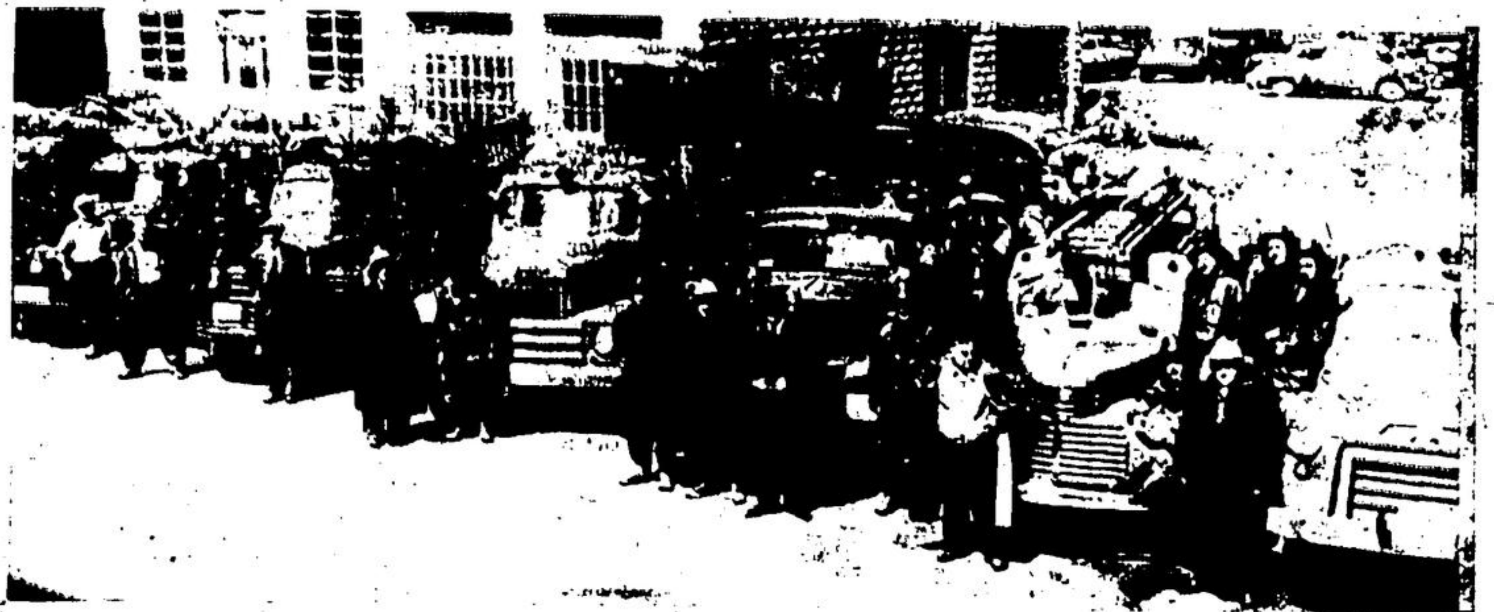
Seven trucks assembled in Milton as Halton's Mutual Aid system received its first workout