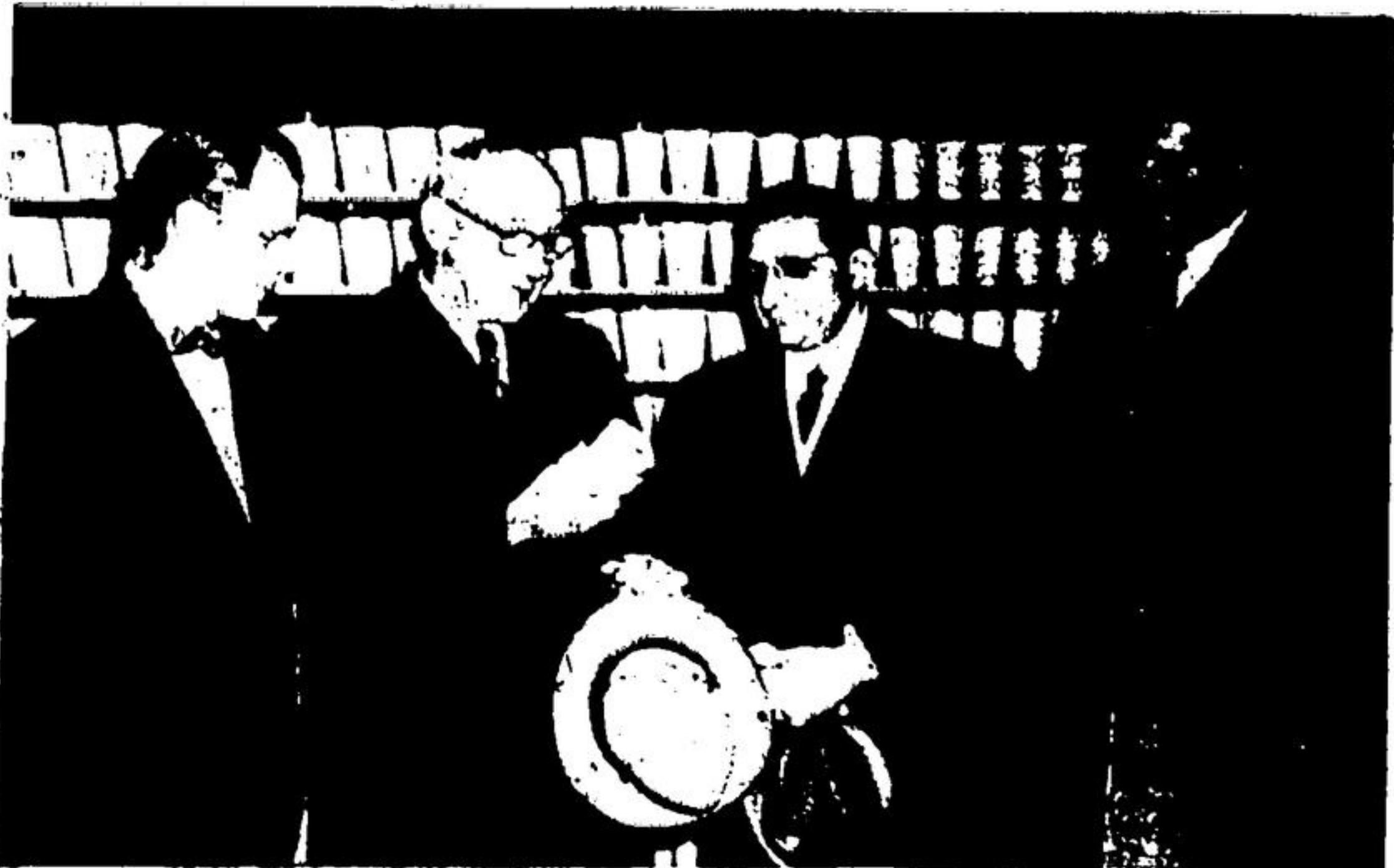
Resuming production just four months after the disastrous fire, officials examine the first products