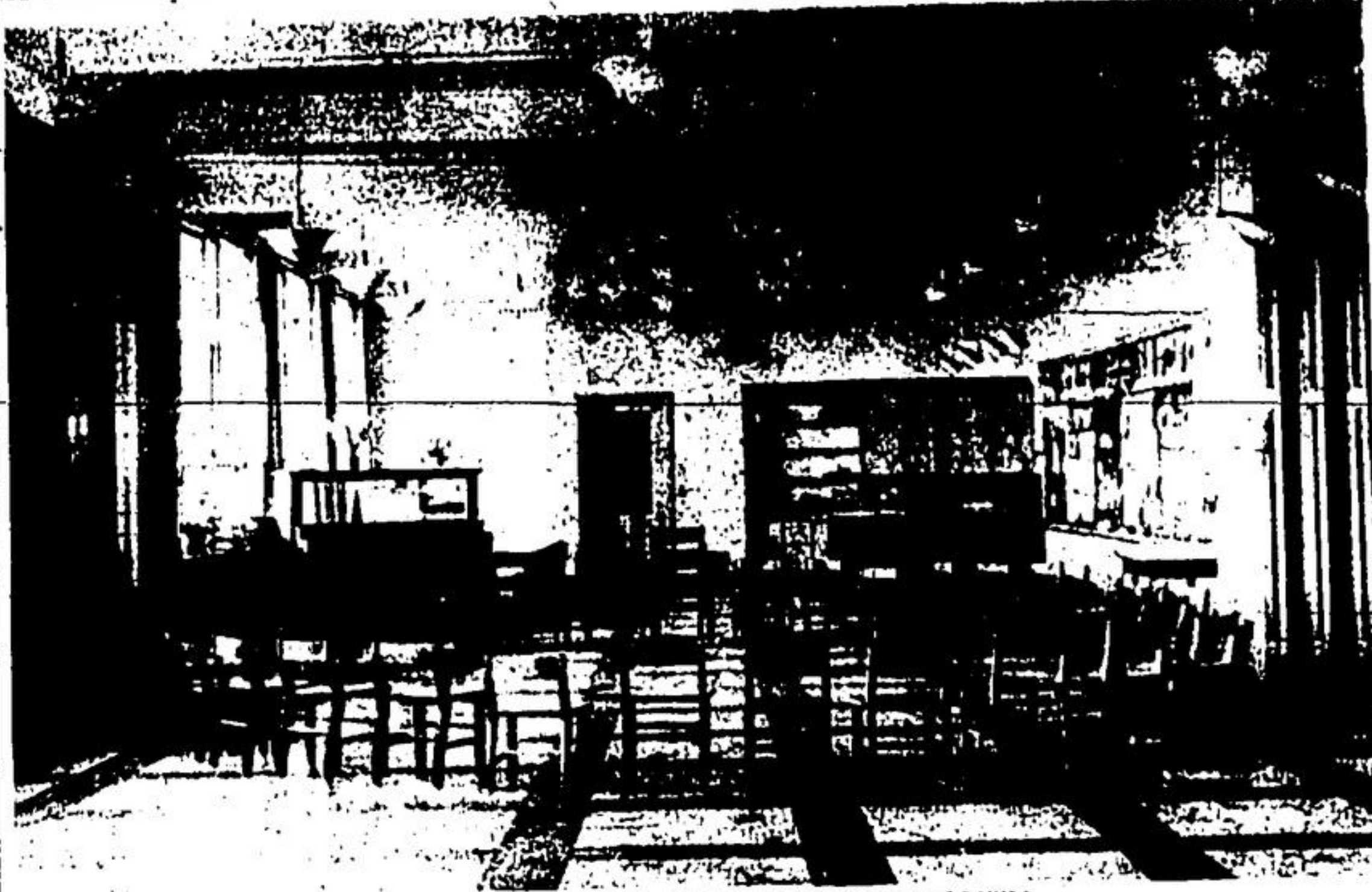
WELL-LIGHTED AND SPACIOUS KINDERGARTEN

Preacher—Now that you've seen what's wrong with my car, how much will you charge to fix it? Mechanic—Well, Reverend, $20 if you stand watching, $10 if you get out of hearing distance.