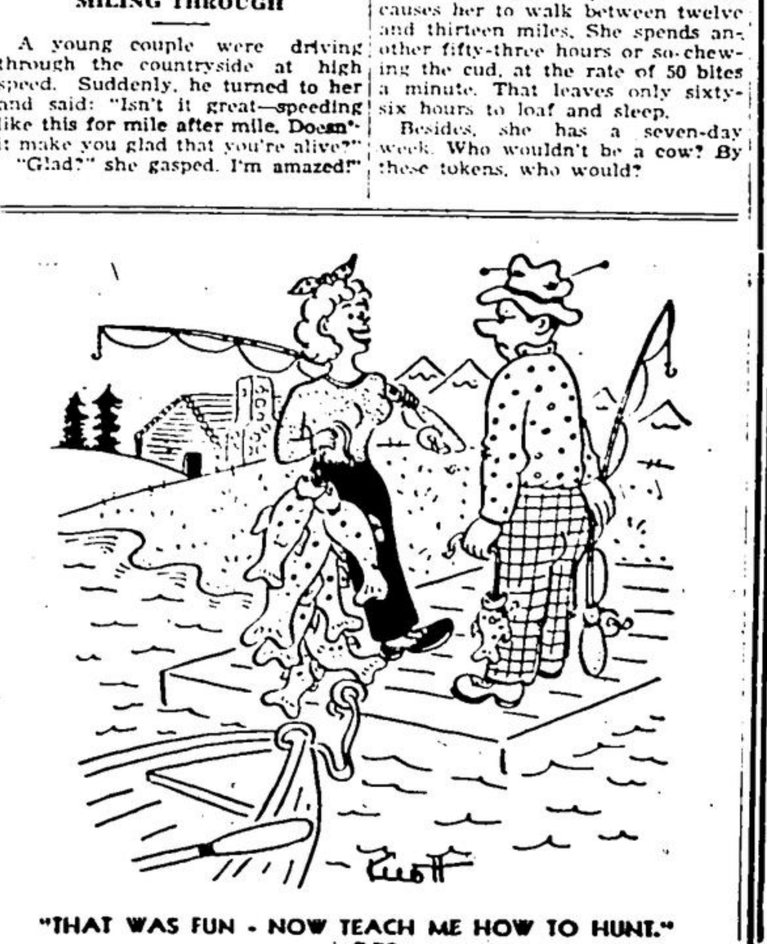
"THAT WAS FUN - NOW TEACH ME HOW TO HUNT."